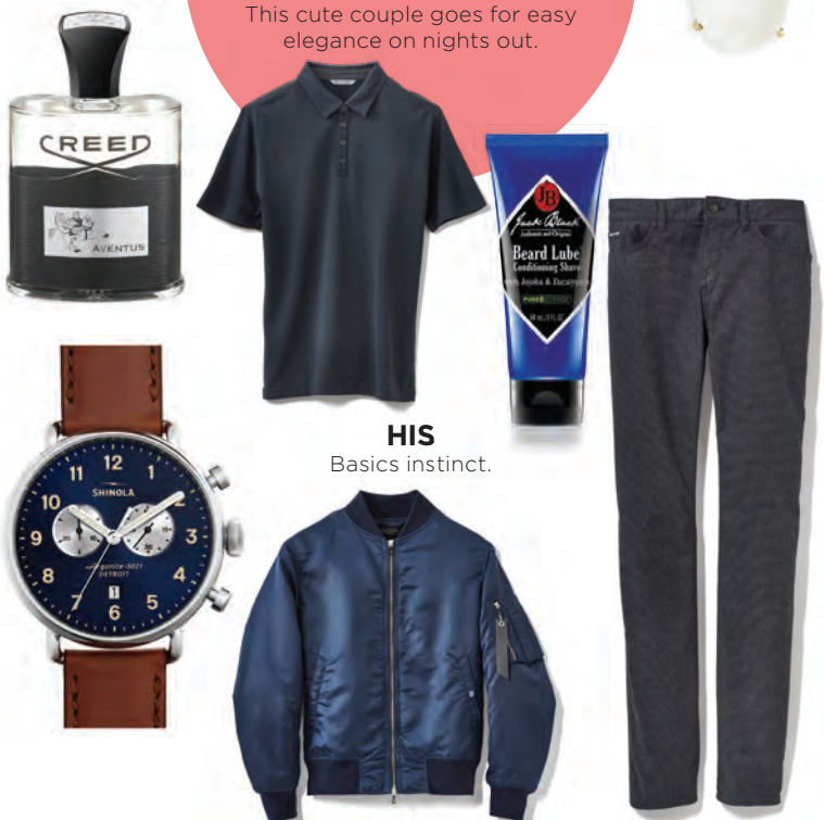
CLOCKWISE, FROM TOP LEFT: COOPER ST DRESS, $297. STEVE MADDEN SHOES, $109.95. GUERLAIN MÉTÉORITES BIRTHDAY CANDLE PEARLS, $76. BURBERRY MY BURBERRY BLUSH EAU DE PARFUM, $158. KATE SPADE NEW YORK EARRINGS, $38. BOSS PANTS, $195. RAG & BONE JACKET, $790. SHINOLA WATCH, $1,065. CREED AVENTUS FRAGRANCE, $558. JOHN VARVATOS TOP, $258. JACK BLACK BEARD LUBE CONDITIONING SHAVE, $13.