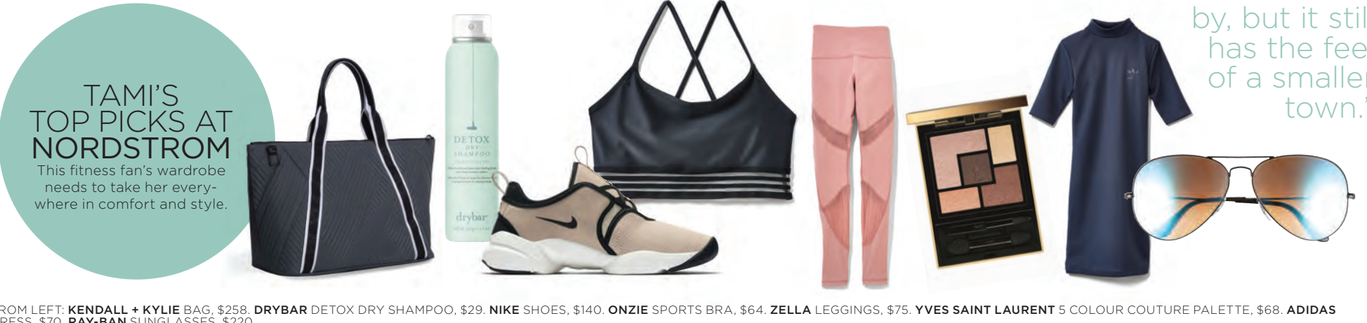
FROM LEFT: KENDALL + KYLIE BAG, $258. DRYBAR DETOX DRY SHAMPOO, $29. NIKE SHOES, $140. ONZIE SPORTS BRA, $64. ZELLA LEGGINGS, $75. YVES SAINT LAURENT 5 COLOUR COUTURE PALETTE, $68. ADIDAS DRESS, $70. RAY-BAN SUNGLASSES, $220.

"There's a great sense of community in Oakville. Everything you need is close by, but it still has the feel of a smaller town."