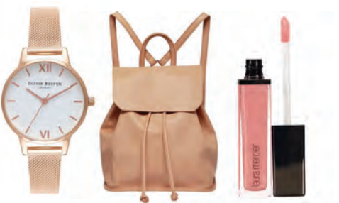
KEZIA'S TOP PICKS OLIVIA BURTON MESH STRAP WATCH, $191. URBAN ORIGINALS MIDNIGHT MEGAN LEATHER FLAP BACKPACK, $116. LAURA MERCIER PINK WASH LIQUID LIP COLOUR, $34.