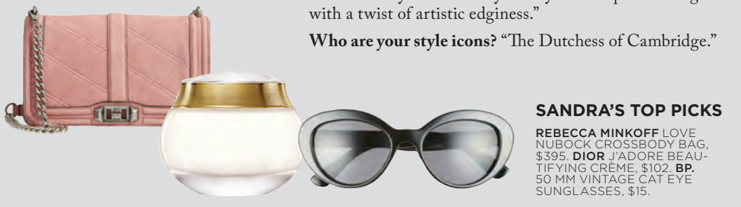
SANDRA'S TOP PICKS REBECCA MINKOFF LOVE NUBUCK CROSSBODY BAG, $395. DIOR J'ADORE BEAUTIFYING CREME, $102. BP 50 MM VINTAGE CAT EYE SUNGLASSES, $15.

Who are your style icons? "The Dutchess of Cambridge."