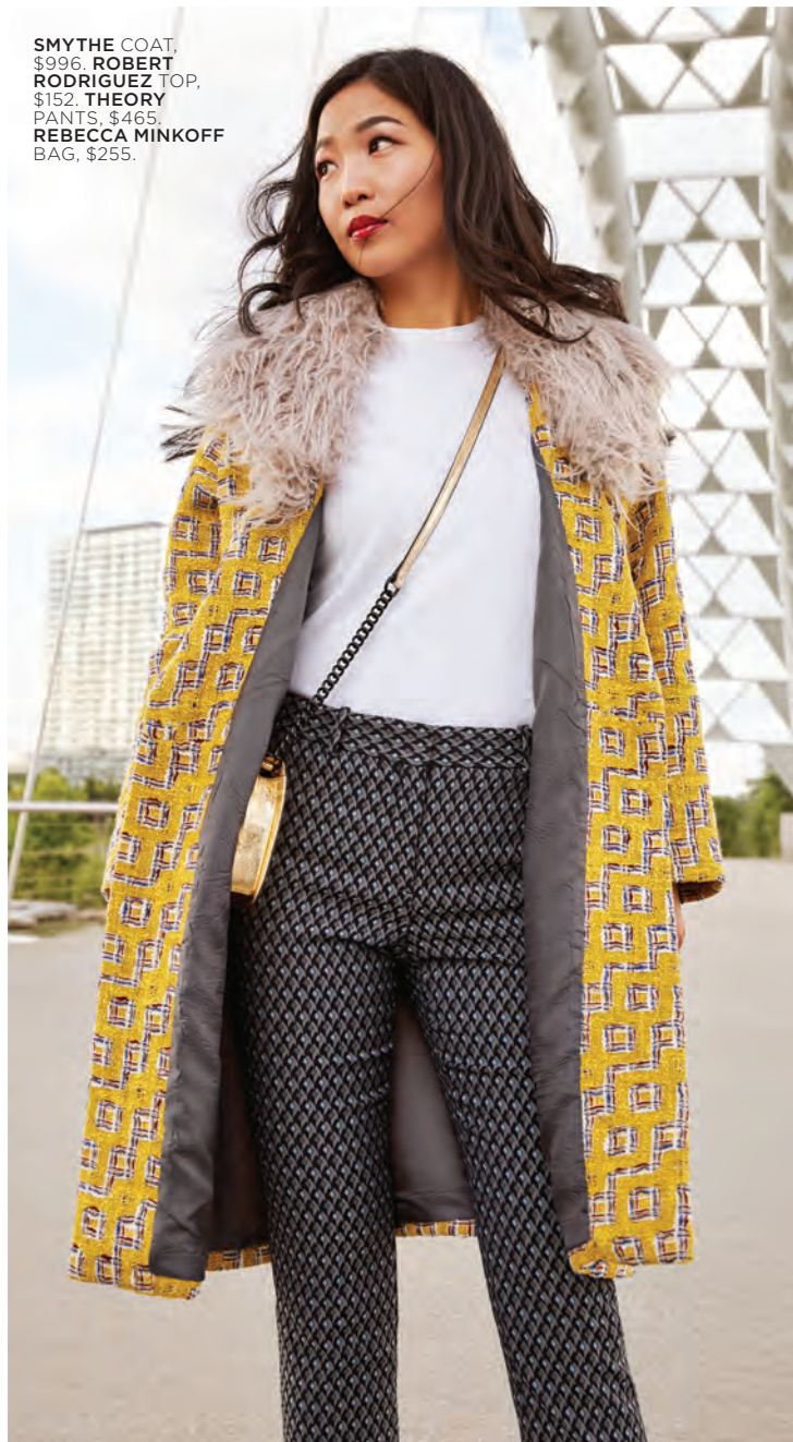
SMYTHE COAT, $996. ROBERT RODRIGUEZ TOP, $152. THEORY PANTS, $465. REBECCA MINKOFF BAG, $255.

The best thing about living in Etobicoke "I like living in Etobicoke because it's safe, quiet and there's a lot of green space. I also like and appreciate the suburban lifestyle and the fact that it's still close to downtown Toronto."