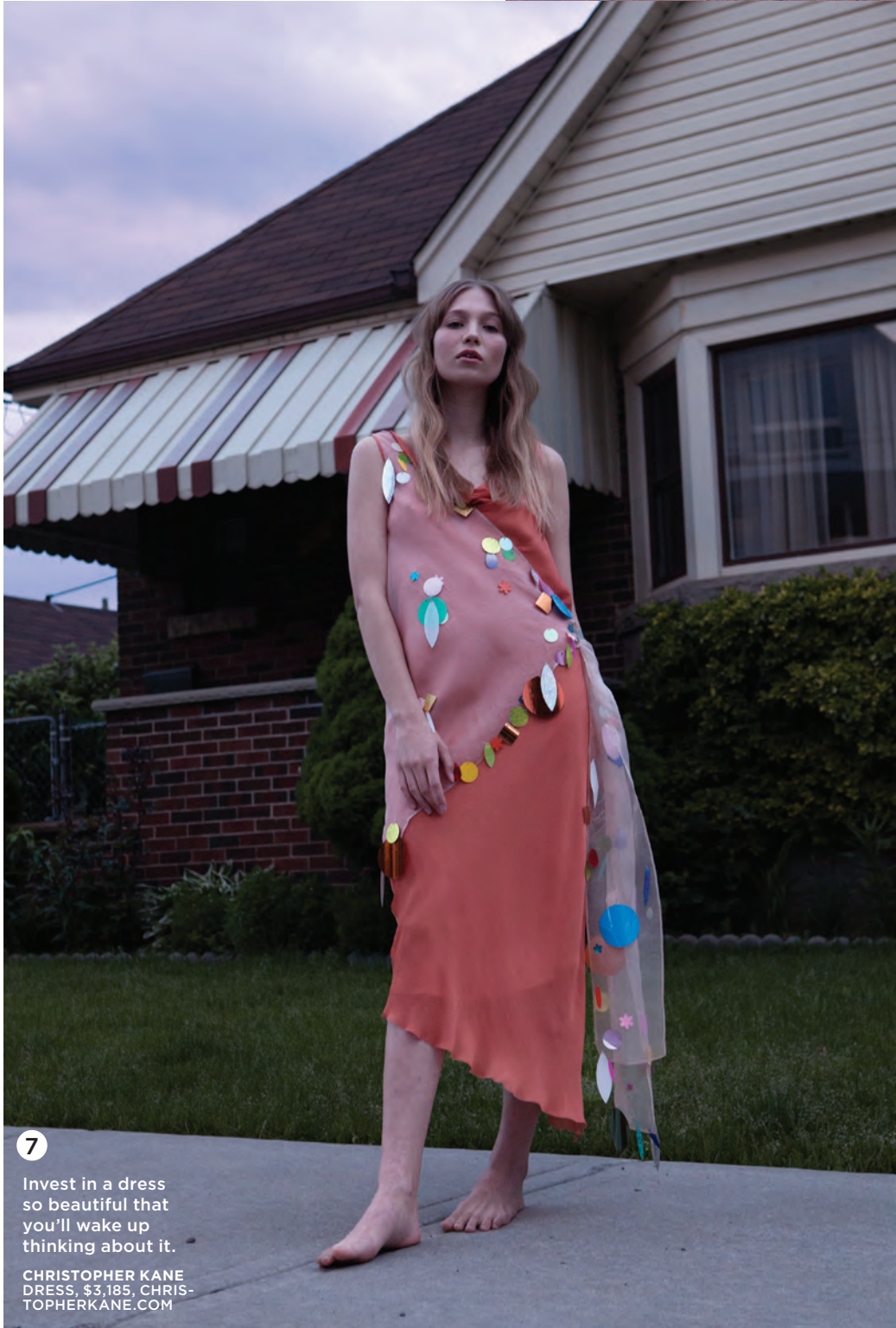
7 Invest in a dress so beautiful that you'll wake up thinking about it. CHRISTOPHER KANE DRESS, $5,105, CHRISTOPHERKANE.COM