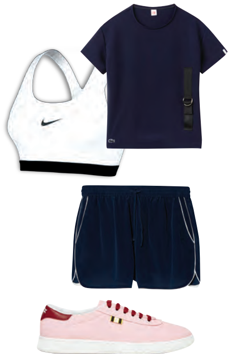
LACOSTE TOP, PRICE UPON REQUEST, LACOSTE.COM. NIKE TOP, $35, NIKE.COM. FRANK AND OAK SHORTS, $80, FRANKANDOAK.COM. APRIX SHOES, $250, APRIXFOOTWEAR.COM

The fitness boom has had a fashionable effect: You'll want to live in this sporty gear until Labour Day.