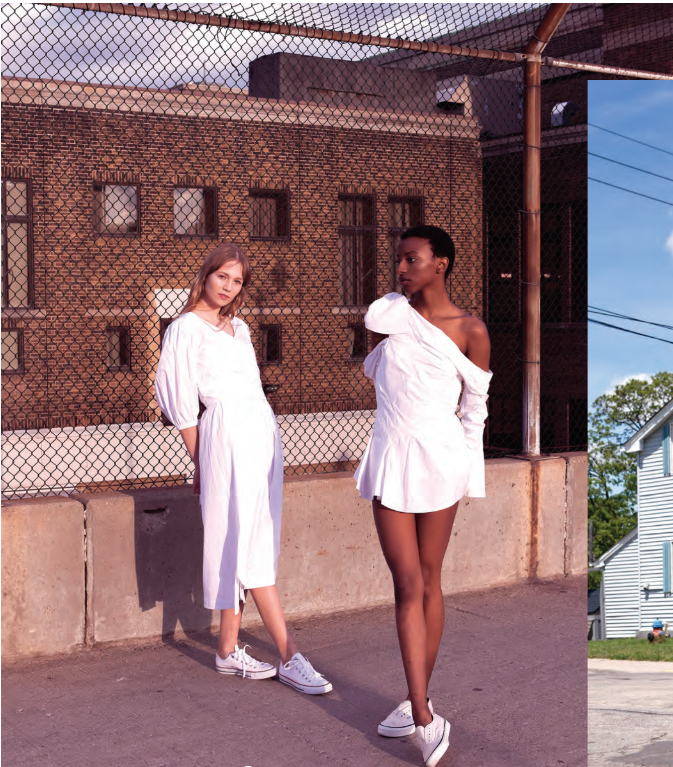
11 Find your perfect LWD. The little white dress is a summer must—all the better if it's crafted from crisp, white cotton. LEFT: ELIZABETH AND JAMES TOP, $360, DRESS, $510, NEIMANMARCUS.COM. RIGHT: MONSE TOP, $1,600, SAKS.COM