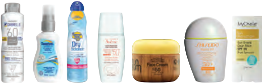
TOOL KIT GARNIER OMBRELLE ULTRA LIGHT ADVANCED BODY CONTINUOUS SPRAY SPF 60, $20, DRUGSTORES. COPPERTONE CLEARLY SHEER LOTION FOR FACE SPF 60, $5, DRUGSTORES. BANANA BOAT DRY BALANCE CLEAR ULTRAMIST SPF 50+, $12, DRUGSTORES. AVENE HIGH PROTECTION ULTRA-LIGHT MINERAL LOTION SPF 50+, $28, DRUGSTORES. SUN BUM SPF 50 FACE CREAM, $13, SHOPPERS DRUG MART. SHISEIDO SPORTS BB 50+ IN MEDIUM, $48, THEBAY.COM. MYCHELLE SUN SHIELD CLEAR STICK SPF 50, $17, BEAUTYBOUTIQUE.CA

On the cusp of high school graduation, I took part in the drunken, burnt-to-a-crisp ritual that is grad trip. My schooling had not prepared me for the dread that is boarding a plane headed to the Dominican Republic alongside hordes of other hormonal teenagers, because that's something you learn in the book of life. It was hell, but I had signed up for it. When we arrived, I dove immediately into my book, the title of which would become prophetic: When You Are Engulfed in Flames by David Sedaris. I finished it by day two. Thanks to fanatical sunscreen use, I swapped my darkened hotel room for the beach, where I soaked up the sand and surf with my friends and created memories I'll cherish forever. Just kidding—it was beach umbrella or bust. I actually scared a cute guy when what he assumed to be a mountain of towels on a chair turned out to be a sunscreen-glazed, fully covered human. At least I avoided turning the tender pink hue that so many on the trip adopted and then shed in flaky strips. Do I regret my week in the sun? No. There were plenty of fun times, which I'm not going to tell you about because that would embarrass too many people. Would I do it again? Also no.