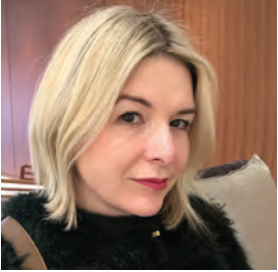
PHOTOGRAPHY: GETTY IMAGES (PERRY, KRAVITZ, STEWART)