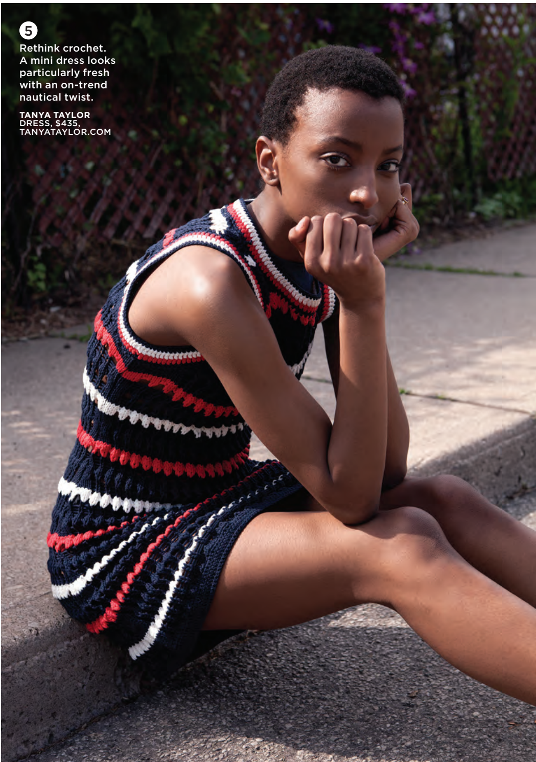
5 Rethink crochet. A mini dress looks particularly fresh with an on-trend nautical twist. TANYA TAYLOR DRESS, $435, TANYATAYLOR.COM