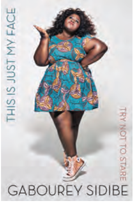
THIS IS JUST MY FACE: TRY NOT TO STARE BY GABOUREY SIDIBE, $33, BOOKSTORES