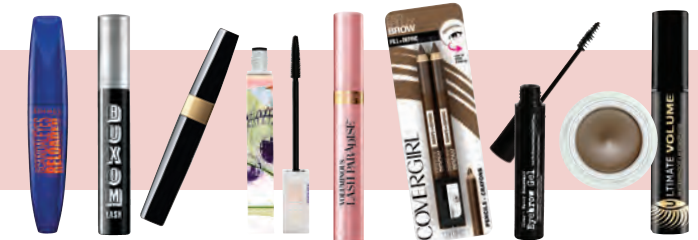
TOOL KIT RIMMEL LONDON WATERPROOF SCANDALEYES RELOADED MASCARA, $9, DRUGSTORES. BUXOM WATERPROOF LASH MASCARA IN BLACKEST BLACK, $25, SEPHORA.CA. CHANEL NIMITABLE WATERPROOF MASCARA IN VERT PROFOND, $41, CHANEL BEAUTY COUNTERS. TEEZ BULLETPROOF MASCARA CURLING, $32, THEBAY.COM. LOREAL PARIS LASH PARADISE WATERPROOF MASCARA, $14, DRUGSTORES. COVERGIRL PROFESSIONAL WATERRESISTANT BLENDABLE BROW PENCIL IN MIDNIGHT BROWN, $7, DRUGSTORES. BROWGAL EYEBROW GEL, $28, THE HUDSON'S BAY. ARTDECO LONGWEAR WATERPROOF GEL CREAM FOR BROWS IN DRIFT WOOD, $19, SHOPPERS DRUG MART. MARCELLE WATERPROOF ULTIMATE VOLUME MASCARA IN BLACK, $12, DRUGSTORES

In the mirror, mascara flecks mingled with ash, the grit of real life. It was that rare moment of electric clarity, when you're both outside yourself and terrifyingly in tune, thrumming along with something bigger. The voice, unbidden, that comes in those moments, and says, "This is real, don't let it slip." The voice that says, "This time, listen." For a moment, I held it like an offering: the storm-darkened sky, the broken house swollen with memory, the sooty rivulets from the rain, but not just the rain.