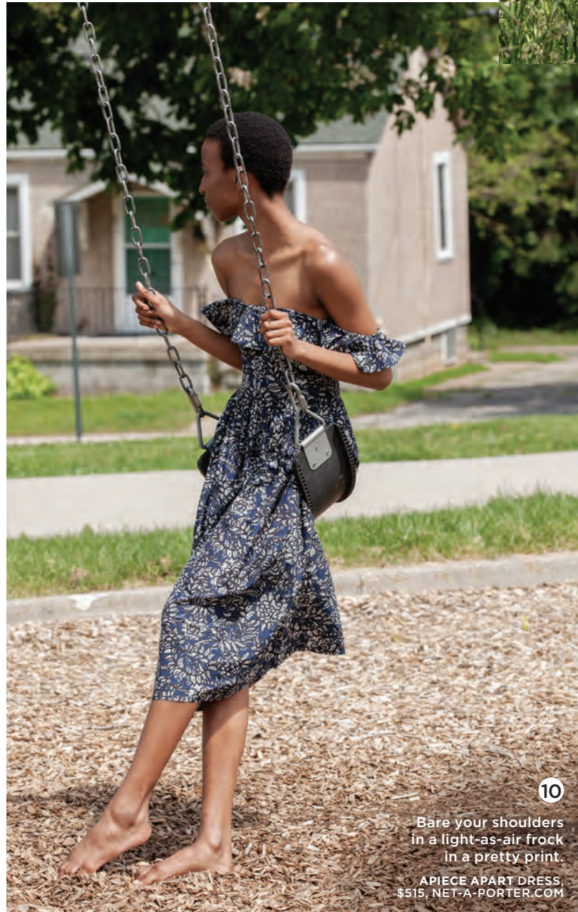
10 Bare your shoulders in a light-as-air frock in a pretty print. APIECE APART DRESS, $515, NET-A-PORTER.COM