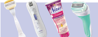
TOOL KIT GILLETTE VENUS COMFORTGLIDE WITH OLAY, $15, DRUGSTORES. PHILIPS SATIN-TOUCH PRECISION EPILATOR, $40, SHOPPERS DRUG MART. NAIR NOURISH CRÈME FOR LEGS AND BODY, $13, DRUGSTORES. SCHICK SENSITIVE CARE RAZOR, $12, DRUGSTORES