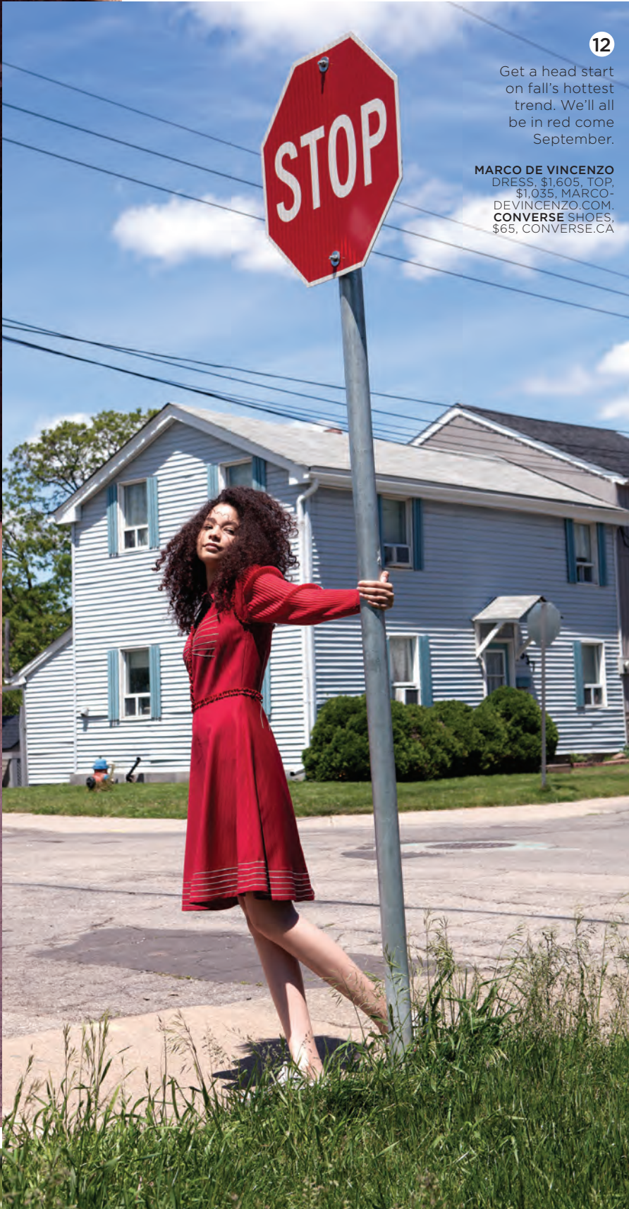
12 Get a head start on fall's hottest trend. We'll all be in red come September. MARCO DE VINCENZO DRESS, $1,605, TOP, $1,035, MARCO-DEVINCENZO.COM. CONVERSE SHOES, $65, CONVERSE.CA