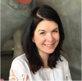
FIRST LIGHT The author’s hair evolution from dark brunette to bright blonde

TOOL KIT OLAPLEX NO.3 HAIR PERFECTOR, $36, OLAPLEX.COM . SHU UEMURA ESSENCE ABSOLUENOURISHING OIL-IN-CREAM, $69, SHUUEMURA.CA . DPHUE COOL CONDITIONER, $32, ULTA.COM . JOICO BLONDE LIFE BRIGHTENING VEIL, $20, SALONS. REDKEN COLOUR EXTEND MAGNETICS MEGAMASK, $25, REDKEN.CA