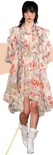
PHILOSOPHY DI LORENZO SERAFINI