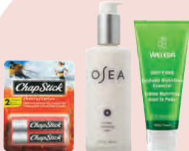
WELEDA SKIN FOOD, $23, WELL.CA