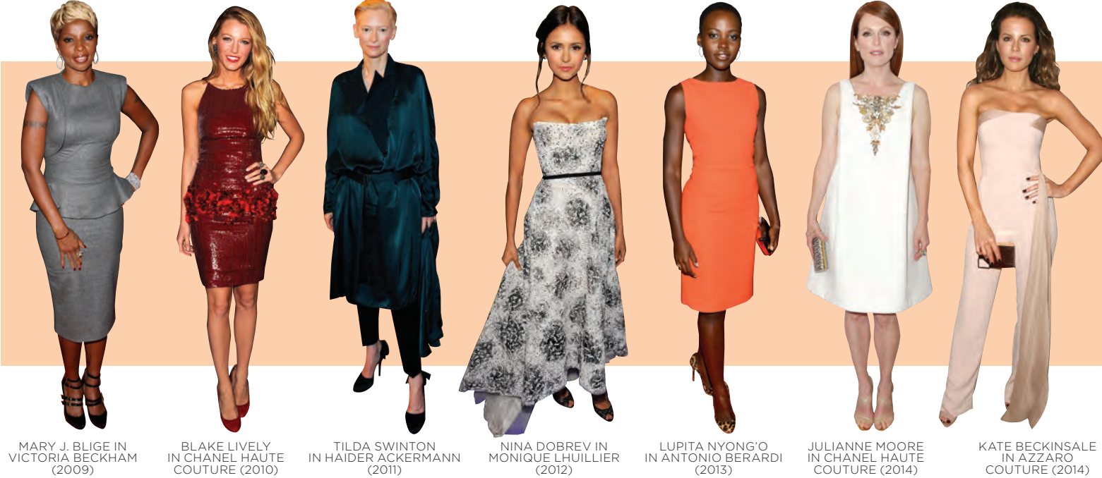
MARY J. BLIGE IN VICTORIA BECKHAM (2009) BLAKE LIVELY IN CHANEL HAUTE COUTURE (2010) TILDA SWINTON IN HAIDER ACKERMANN (2011) NINA DOBREV IN MONIQUE LHUILLIER (2012) LUPITA NYONG'O IN ANTONIO BERARDI (2013) JULIANNE MOORE IN CHANEL HAUTE COUTURE (2014) KATE BECKINSALE IN AZZARO COUTURE (2014)

TIFF gets bigger every year—and so does the fashion! Here are our fave festival red carpet looks