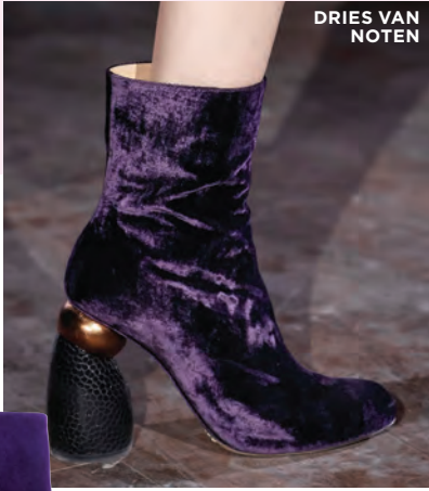
DRIES VAN NOTEN