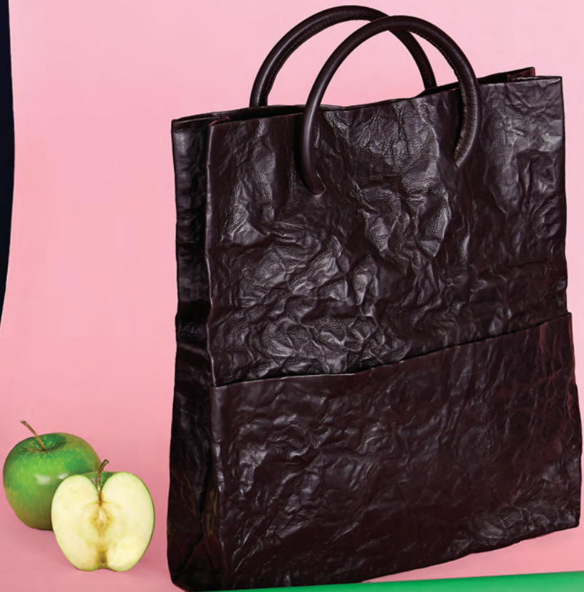
COS BAG, $290, COS

While questionable cafeteria fare, piercing recess bells and, yes, getting picked last in gym class may be a distant memory, the glee of back-to-school shopping will never get old. At the top of our fall list: this post-grad version of your brown-paper lunch bag. As wrinkled as a rushed morning, it's a totally chic and undeniably practical option for your textbooks, meeting notes—or even your lunch. —Jillian Vieira.