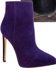
NINE WEST SHOES, $220, NINEWEST.CA