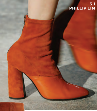
3.1 PHILLIP LIM