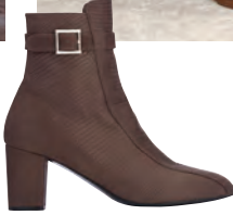
NEWBARK SHOES, PRICE UPON REQUEST, NEWBARK.COM