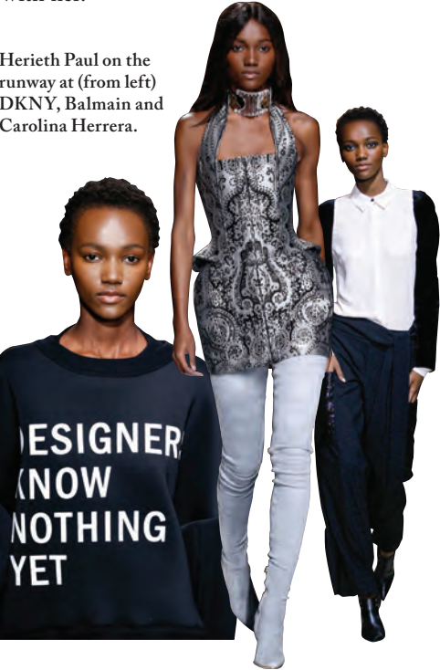
Herieth Paul on the runway at (from left) DKNY, Balmain and Carolina Herrera.

Who do you look up to in the industry? "Tyra Banks. She launched her career from nothing and made a stand, which is hard to do as a woman—especially as a black woman. She's life goals. I would die if I got to have pizza with her."