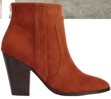
CALL IT SPRING SHOES, $70, CALLITSPRING.COM