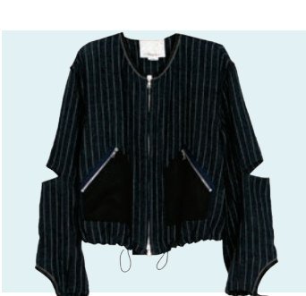
Oversized Phillip Lim of 3.1 Phillip Lim

Why jeans never go out of style: “They’re an amazing neutralizer to any outfit—and denim just gets better with age.”