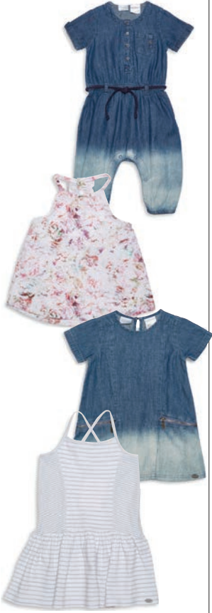
KARDASHIAN KIDS JUMPSUIT, $40, TOP, $30, DRESS, $39, DROP-WAIST DRESS, $45, THEBABY.COM

Do you think about what you want your legacy to be? “I just want my kids to feel loved. It’s not so much about my brand and my work—to me that’s minimal in comparison. I just care what my kids think about me as a person.”