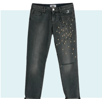
Heavily embellished Paige Adams Geller of Paige

Why jeans never go out of style: “They can be dressed up as ‘cocktail denim’ or worn for comfy weekend wear. Jeans truly take you anywhere from morning to moonlight.”