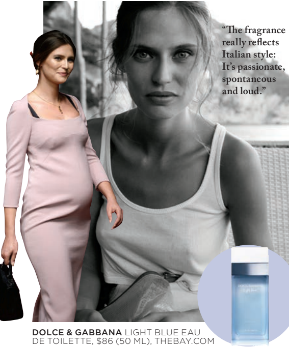
DOLCE & GABBANA LIGHT BLUE EAU DE TOILETTE, $86 (50 ML), THEBAY.COM