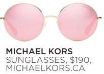
MICHAEL KORS SUNGLASSES, $190, MICHAELKORS.CA

Backup: "My favourite spa in Montreal is at Hotel Le St-James for a couples massage. The private room is nestled in the vault of a former bank."