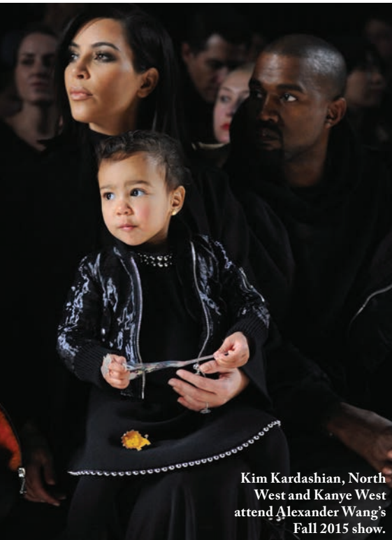
Kim Kardashian, North West and Kanye West attend Alexander Wang's Fall 2015 show.

And now that you have two? “It’s like a whole different world. One is easy. Everyone would come up to us and say how difficult two is, and we just kind of laughed it off. And now I really, really understand it. It’s like any free time that you thought you had when the baby’s sleeping, or napping, or anything—you don’t have that anymore. It’s like a full assembly line, like, ‘Okay, this one needs a bath, and then this one needs a bath,’ and then ‘Is everyone dressed?’”