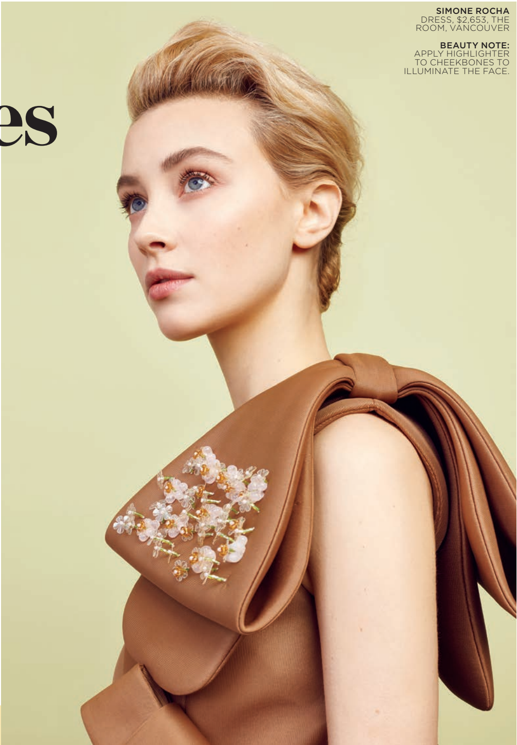
SIMONE ROCHA DRESS, $2,653, THE ROOM, VANCOUVER

BEAUTY NOTE: APPLY HIGHLIGHTER TO CHEEKBONES TO ILLUMINATE THE FACE.