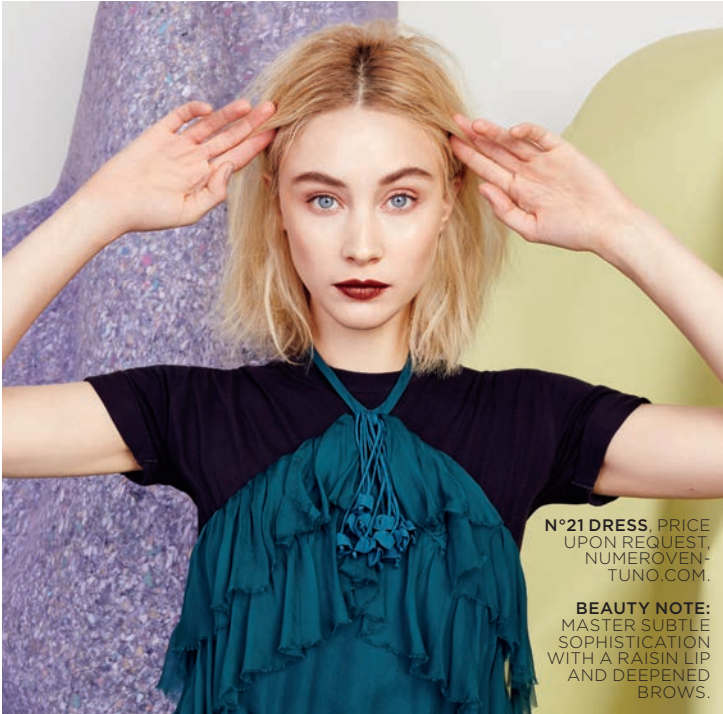
N°21 DRESS, PRICE UPON REQUEST, NUMEROVEN-TUNO.COM.

BEAUTY NOTE: APPLY HIGHLIGHTER TO CHEEKBONES TO ILLUMINATE THE FACE.