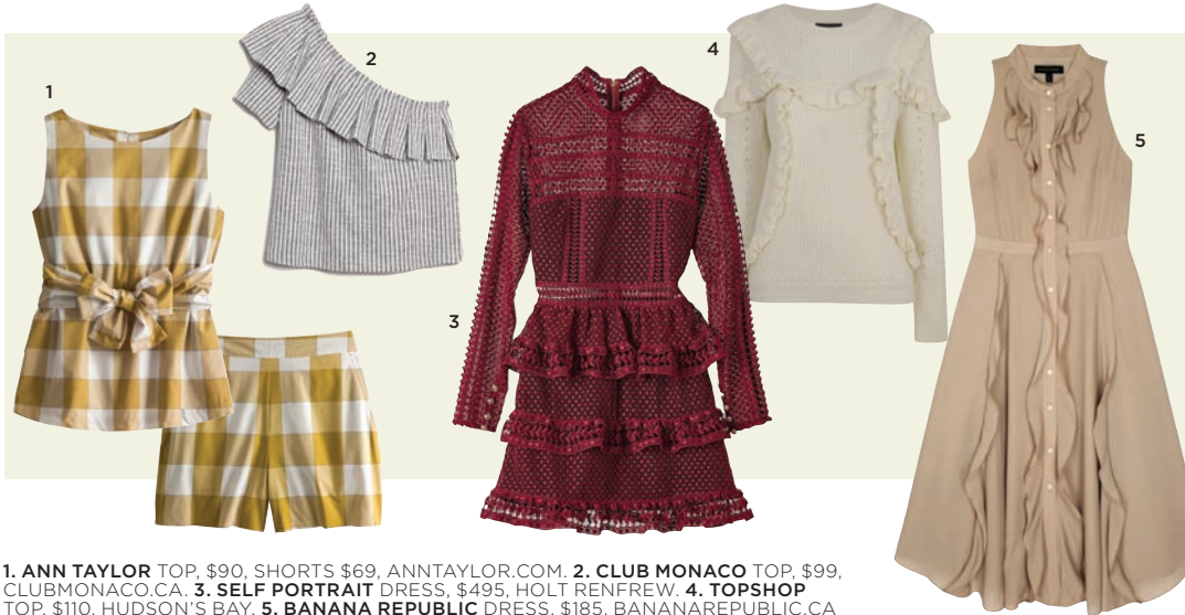
1. ANN TAYLOR TOP, $90, SHORTS $69, ANNTAYLOR.COM. 2. CLUB MONACO TOP, $99, CLUBMONACO.CA. 3. SELF PORTRAIT DRESS, $495, HOLT RENFREW. 4. TOPSHOP TOP, $110, HUDSON'S BAY. 5. BANANA REPUBLIC DRESS, $185, BANANAREPUBLIC.CA

Yes, you can wear ruffles and bows for day. Start with these pieces