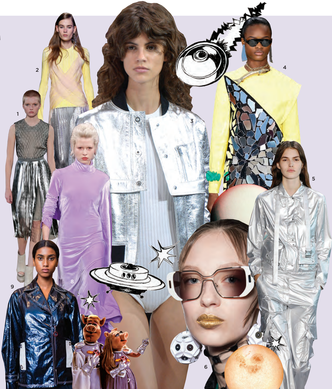
1. Iris van Herpen's molten metal illusions. 2. Striking silver pleats at Emilio Pucci. 3. Mylar-like varsity jackets at Courr  ges. 4. Broken-mirror detailing at Loewe. 5. Spacesuit chic at Lacoste. 6. Futuristic gold lips at Prada. 7. Captain Link Hogthrob and First Mate Piggy in The Muppet Show . 8. Velvet alien vibes at Vetements. 9. Iridescent coats at Edun, calling to mind high-tech spaceship material.

M.A.C GLITTER IN 3D SILVER, $26, MACCOSMETICS.CA