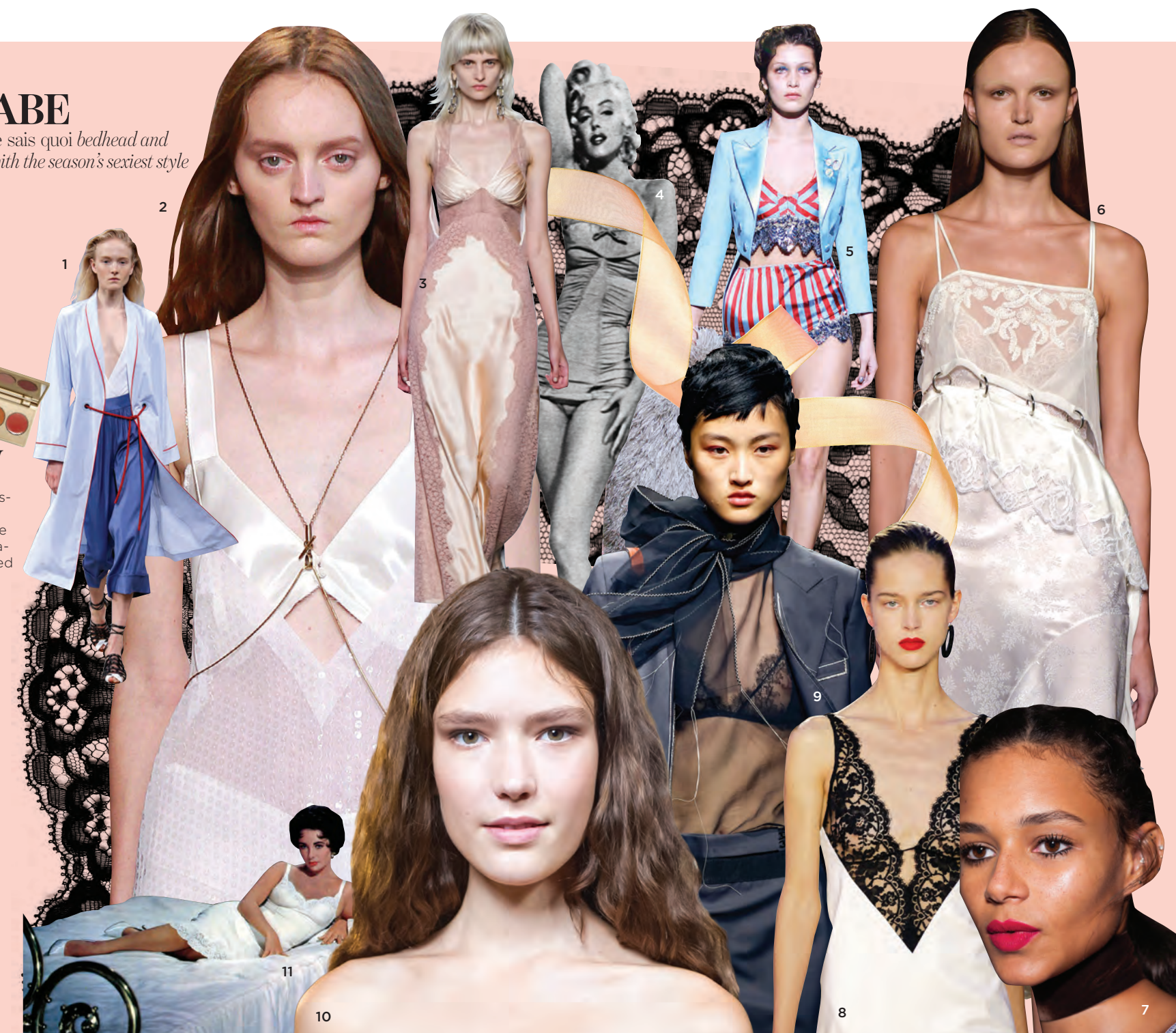
1. Back-to-bed housecoats at Thakoon. 2. Body chains and sequins meet at Calvin Klein. 3. Alexander Wang's vintage-inspired negligee. 4. Marilyn Monroe, the ultimate pin-up, 1953. 5. Silky separates at Marc Jacobs. 6. Deconstructed slips by Riccardo Tisci at Givenchy. 7. Alluring ruby lips at Giles. 8. Plunging necklines at C  line. 9. Alber Elbaz's sexed-up workwear at Lanvin. 10. Rumpled waves at Stella McCartney. 11. Elizabeth Taylor in Cat on a Hot Tin Roof , 1958.

FROM LEFT: JI OH DRESS, $1,335, JOHNNY.COM. TOPSHOP DRESS, $65, THEBAY.COM