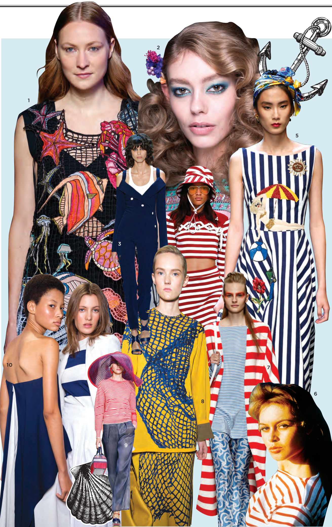
1. A school of underwater creatures at Emilio Pucci. 2. Caribbean eyeshadow hues at Diane von Furstenberg. 3. Chic Navy uniforms at Mugler. 4. House of Holland's tugboat-captain style. 5. Life's a beach at Dolce & Gabbana. 6. Brigitte Bardot channels Mediterranean chic in the classic Breton top, 1956. 7. Stripes on stripes at Max Mara. 8. Sportmax's striking net print. 9. Yacht-appropriate garb at Giorgio Armani. 10. New England nautical at Ralph Lauren.

Leave it to Dolce & Gabbana to up the season's seen-everywhere camera bag with a cheeky Kodak lookalike.