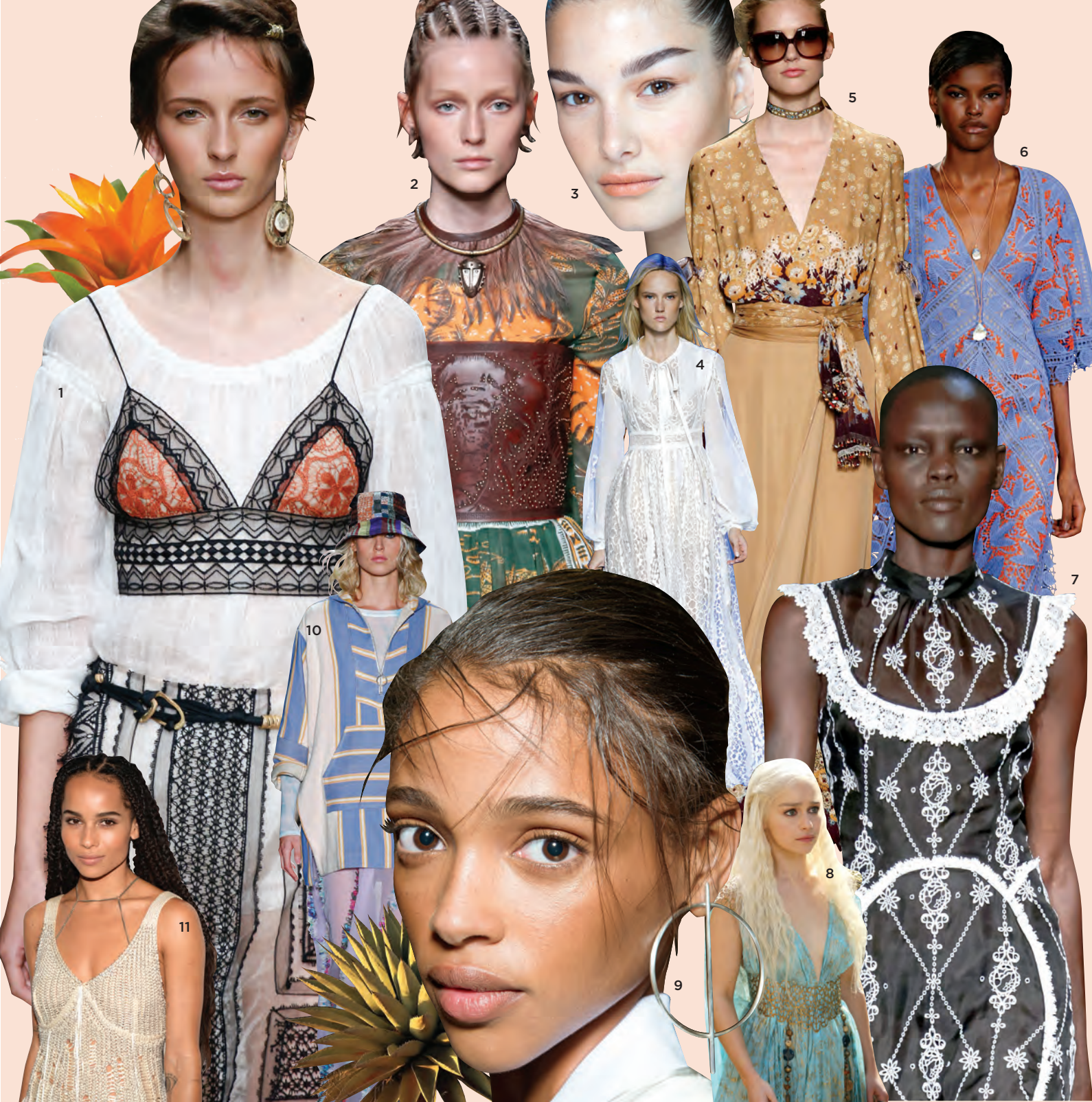
1. Alberta Ferretti delves into desert wear. 2. Feathers and leathers at Valentino. 3. Subtle earth tones at Balmain. 4. Elie Saab's mirage-like evening gowns. 5. Folksy inspiration at Etro. 6. Rich hues meet delicate lace at Tory Burch. 7. Pretty prairie dressing at Erdem. 8. Game of Thrones 's Khaleesi is the queen of boho chic. 9. Windswept hair and tanned faces at Michael Kors. 10. BCBG Max Azria's California road trippers. 11. Actor Z   Kravitz's easy elegance.