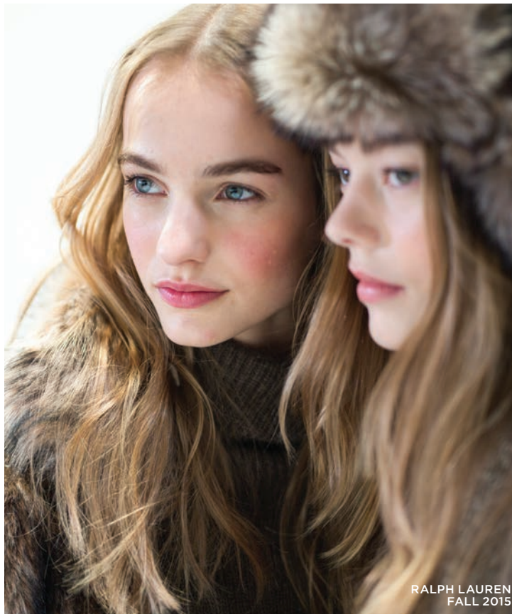
RALPH LAUREN FALL 2015

But Kellett insists that it's not just size that counts. "A higher-quality hyaluronic acid could be equivalent to one that's in a microsphere delivery system," she says, adding that either way, topically applied hyaluronic acid will have only temporary effects. "Remember, skin is actually a barrier: You can put things on top of it to make it look better, but it's not going to last long or treat the deep dermis of the skin." That's where the magic happens: melanin and oil production, cell turnover—everything that affects skin's texture, tone and firmness—and where it makes its own hyaluronic-acid supply. You'd need to see a dermatologist for an injectable hyaluronic acid filler for serious wrinkle-reducing or plumping results.