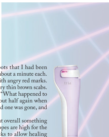
TRIA AGE-DEFYING LASER, $569, TRIABEAUTY.CA

In the end, only one person noticed a change, but she knew I was using the laser. Actually, that's not true: I noticed, and so did my now-underworked concealer tube.