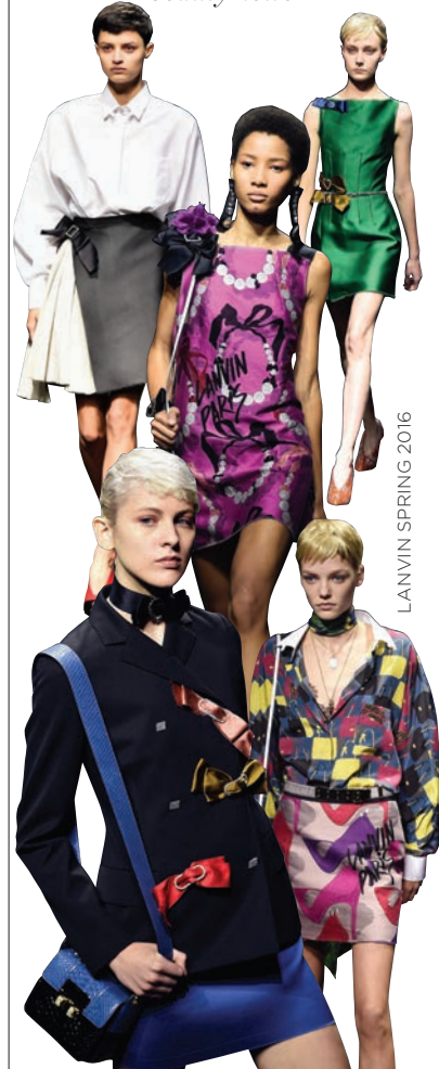
LANVIN SPRING 2016