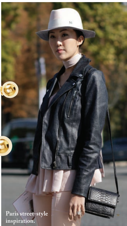
Paris street-style inspiration.