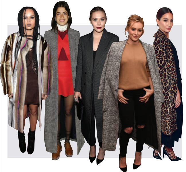
Celebrity inspiration (from left): Actor Zoë Kravitz, blogger Leandra Medine, actor Elizabeth Olsen, actor/singer Hilary Duff, model Lily Aldridge.