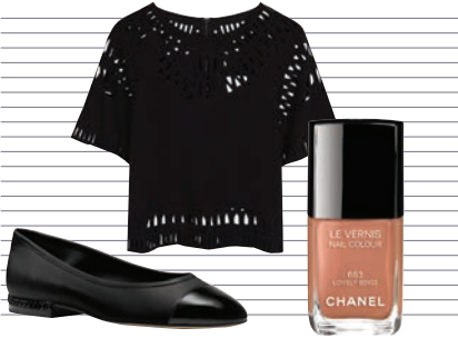
MICHAEL MICHAEL KORS FLATS, $168, MICHAELKORS.CA. SEA TOP, $420, HOLT RENFREW. CHANEL LE VERNIS IN LOVELY BEIGE, $31, CHANEL COUNTERS