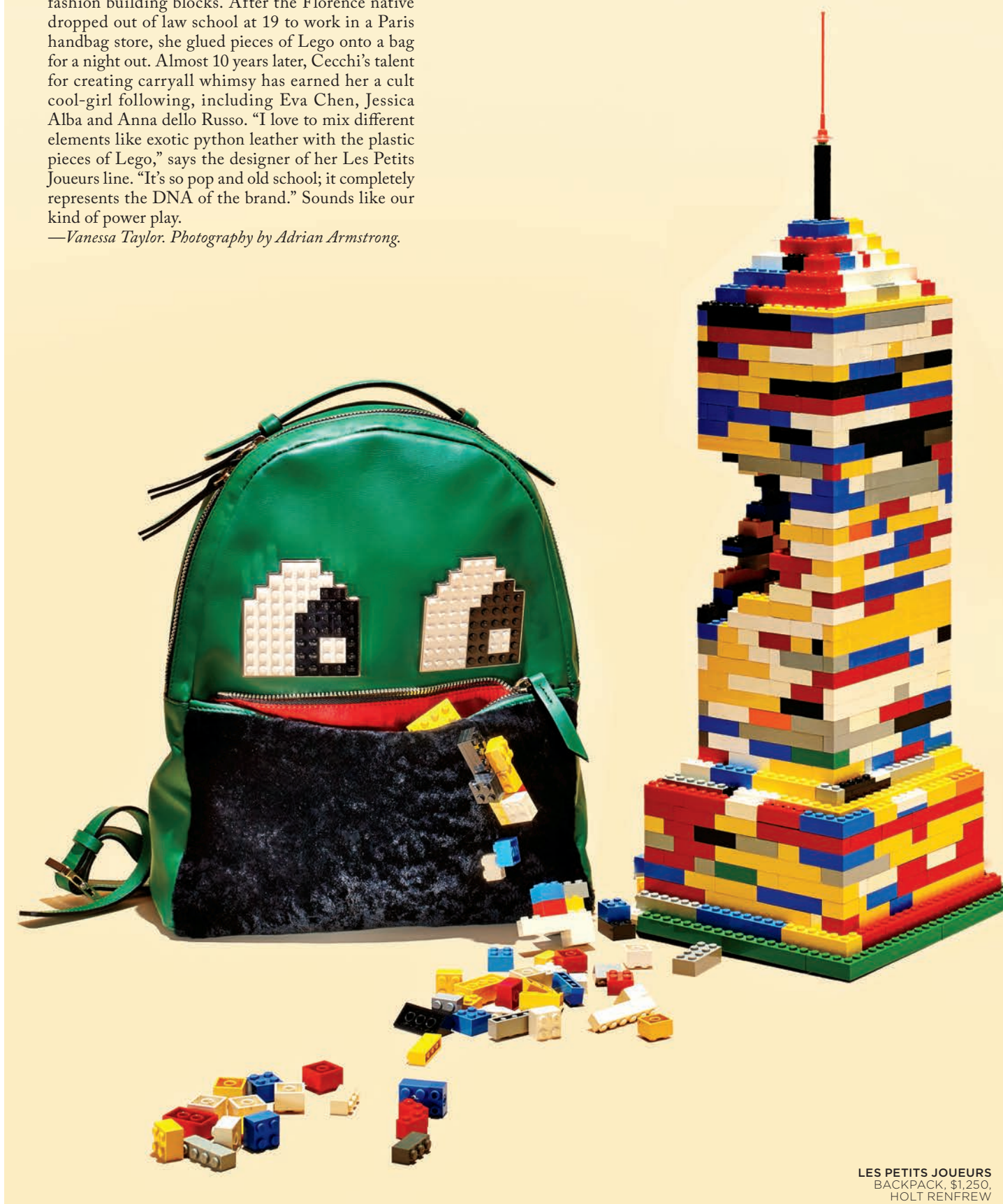
LES PETITS JOUEURS BACKPACK, $1,250, HOLT RENFREW