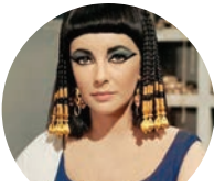
Elizabeth Taylor as Cleopatra

To Catch a Thief (1955) Impossibly elegant Frances Stevens gallivanted around the south of France, dripping with diamonds and outfitted in gossamer gowns, selected by famed costume designer Edith Head.