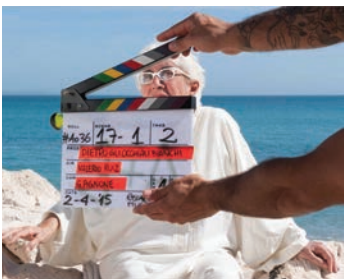
tiff_net Happy 89th to Lina Wertmüller, the first woman ever to be nominated for an Academy Award for Best Direction. AUGUST 14, 2015

Head to thekit.ca every Friday for a roundup of the best beauty and style snaps