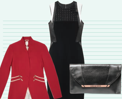
TRISTAN BLAZER, $250, TRISTANSTYLE.COM. JUDITH & CHARLES DRESS, $450, JUDITHANDCHARLES.COM. CAROLINE NERON CLUTCH, $195, CAROLINENERON.COM

CEO and owner of Gusto 54 Restaurant Group (Trattoria Nervosa, Pai Northern Thai Kitchen, Gusto 101 and Gusto 54 catering)