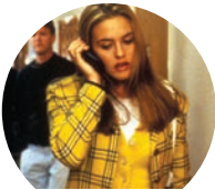
Alicia Silverstone as Cher Horowitz

Annie Hall (1977) Diane Keaton's off-screen gender-bending style inspired her character's on-screen shirt-tie-vest-black-hat combo, which dominated the film—and every stylish woman's closet.