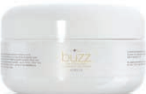
SHINE-ENHANCING POMADE LIKE WORLD'S BUZZ HAIR AND BODY POLISH, $46, WORLD.CA

A glossy knotted ponytail and an exaggerated cat-eye add up to a look we love