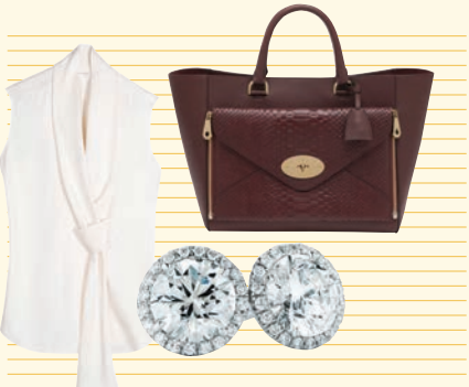
VICTORIA BECKHAM BLOUSE, $1,380, HOLT RENFREW. FOREVERMARK BY JADE TRAU EARRINGS, STARTING AT $10,000, FOREVERMARK.COM. MULBERRY BAG, $2,560, MULBERRY.COM