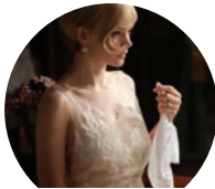
Carey Mulligan as Daisy Buchanan

Clueless (1995) Cher made matchy-matchy plaid and knee socks look good, but it was her computer-powered closet concierge that had '90s teens totally buggin' in the pre-smartphone era.