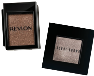
REVLON COLORSTAY SHADOWLINKS IN JAVA, $4, SHOPPERS DRUG MART. BOBBI BROWN SHIMMER WASH EYE SHADOW IN STONE, $28, BOBBI-BROWNCOSMETICS.CA