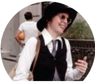
Diane Keaton as Annie Hall

Cleopatra (1963) Talk about fashion royalty: The tale of the troubled Egyptian queen featured a 24-karat-gold-cloth cape, 65 costume changes and the iconic graphic liner that redefined the cat-eye.