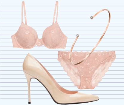
SCANDALE PARIS BRA, $24, BRIEFS, $10, LAVIEENROSE.COM. GABRIELLA ARTIGAS CUFF, $775, KAVUT.COM. STUART WEITZMAN HEELS, $425, STUARTWEITZMAN.CA