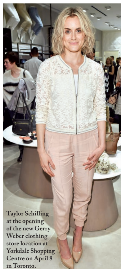
Taylor Schilling at the opening of the new Gerry Weber clothing store location at Yorkdale Shopping Centre on April 8 in Toronto.

Counting down to Orange Is the New Black's third season, the show's lead inmate talks red-carpet style, the changing roles for women and what she'd smuggle into jail