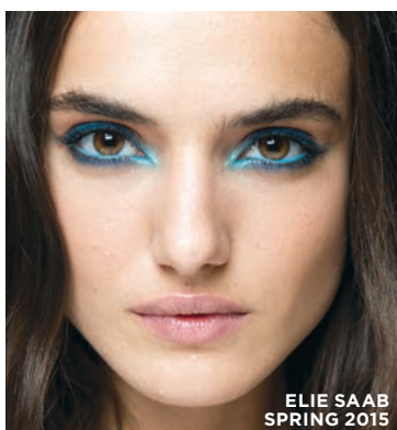
ELIE SAAB SPRING 2015