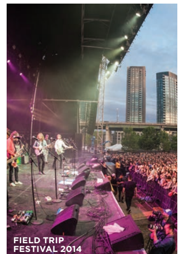
FIELD TRIP FESTIVAL 2014

Proud sponsor of the TD Toronto Jazz Festival