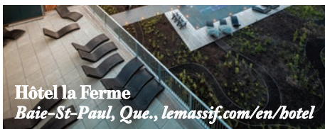
Hôtel la Ferme Baie-St-Paul, Que., lemassif.com/en/hotel