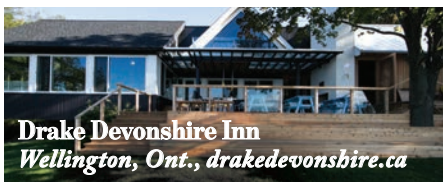
Drake Devonshire Inn Wellington, Ont., drakedevonshire.ca