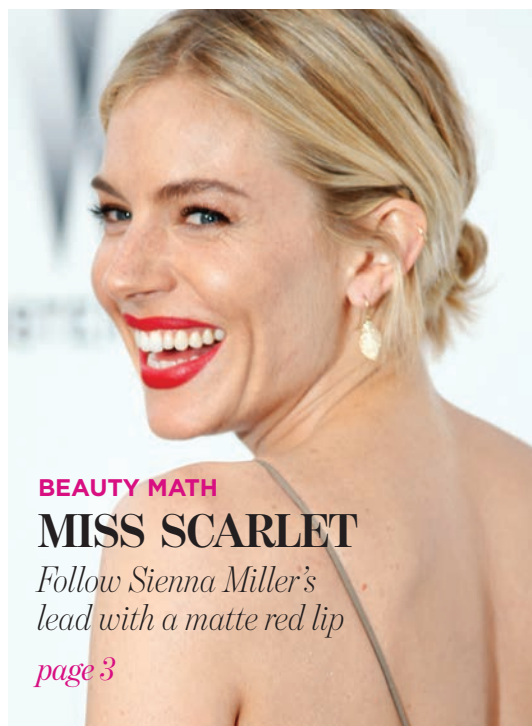
BEAUTY MATH MISS SCARLET Follow Sienna Miller's lead with a matte red lip page 3