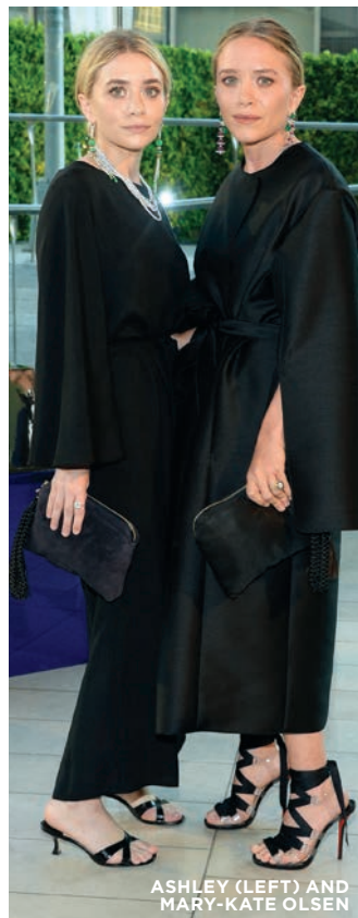
ASHLEY (LEFT) AND MARY-KATE OLSEN