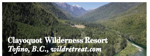
Clayoquot Wilderness Resort Tofino, B.C., wildretreat.com

From Vancouver: One-hour float-plane ride