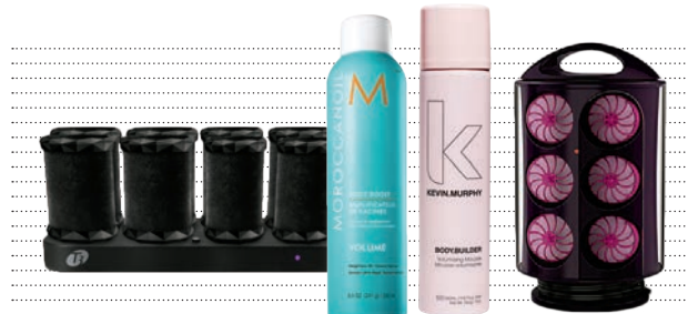
T3 VOLUMINOUS HOT ROLLERS SET, $129, SEPHORA.CA. MOROCCANOIL ROOT BOOST, $32, MOROCCANOIL.CA. KEVIN. MURPHY BODY BUILDER VOLUMISING MOUSSE, $28, SALONS. CONAIR INFINITI PRO SECRET CURL, $60, SHOPPERS DRUG MART