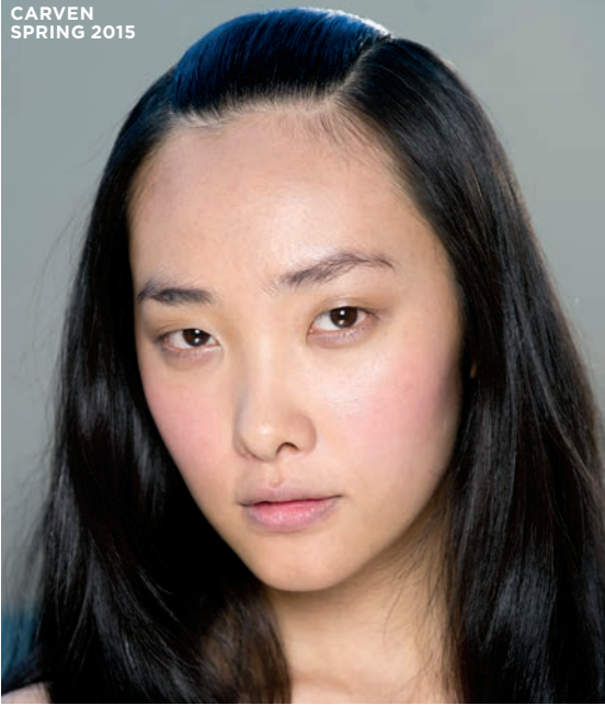
CARVEN SPRING 2015