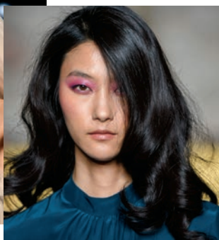
MATTHEW WILLIAMSON SPRING 2015