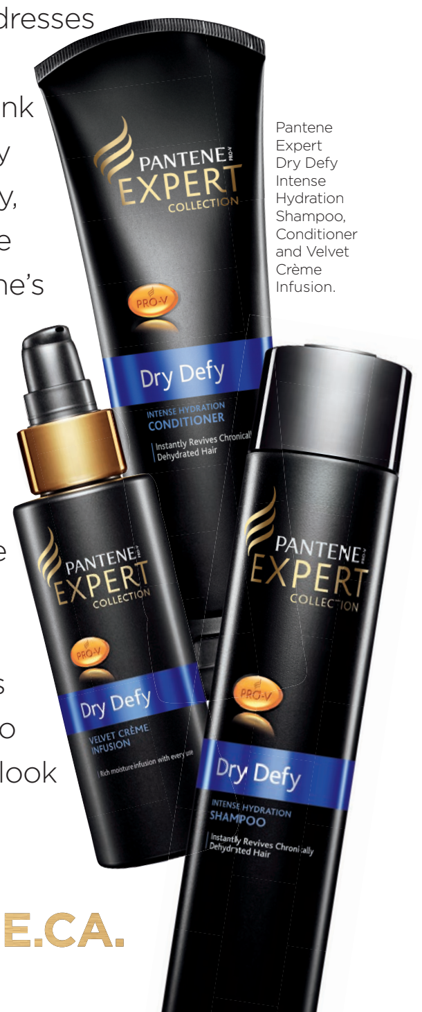
Pantene Expert Dry Defy Intense Hydration Shampoo, Conditioner and Velvet Crème Infusion.

"Sometimes women are afraid to use a product that addresses severely dry hair because they think it will look greasy and be too heavy, but that's not the case with Pantene's new Dry Defy Collection. I love it because it is lightweight, providing your hair the moisture it needs, but it doesn't interfere with the benefits of your stylers, so you can get the look you're after!"