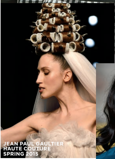
JEAN PAUL GAULTIER HAUTE COUTURE SPRING 2015