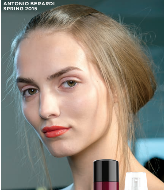
ANTONIO BERARDI SPRING 2015