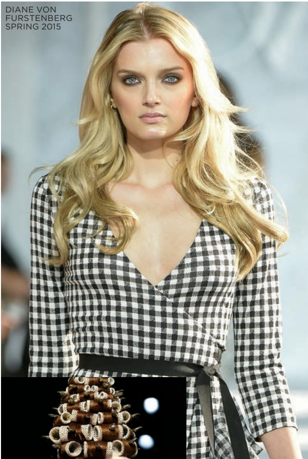
DIANE VON FURSTENBERG SPRING 2015