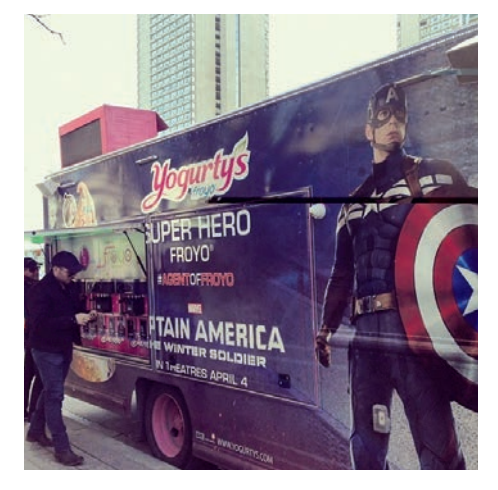
AFTERNOON TREAT Oh hey @Yogurtys, thanks for stopping by! #agentoffroyo

Go behind the scenes with our team at photo shoots, events and more. Follow us at instagram.com/thekitca