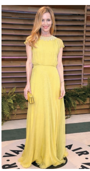
SUNNY SIDE LESLIE MANN IN JENNY PACKHAM