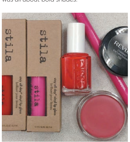
DESKTOP DECORATION Our work spaces are filled with pops of pink and bright corals.