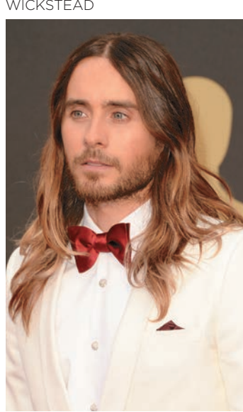
CRIMSON COOL JARED LETO IN SAINT LAURENT