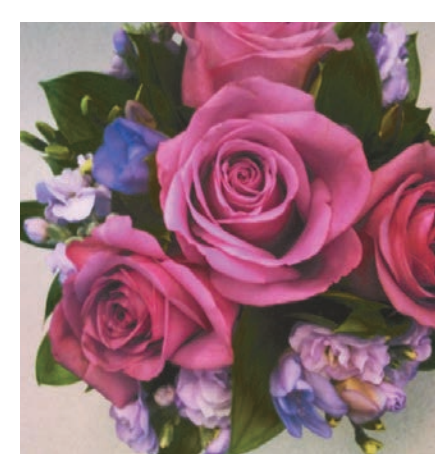
SPECIAL DELIVERY Live Clean prettied up our office with these gorgeous blooms.

Go behind the scenes with our team at photo shoots, events and more. Follow us at instagram.com/thekitca