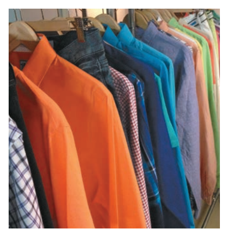
BRIGHTEN UP At the Express men's summer preview, it was all about bold shades.