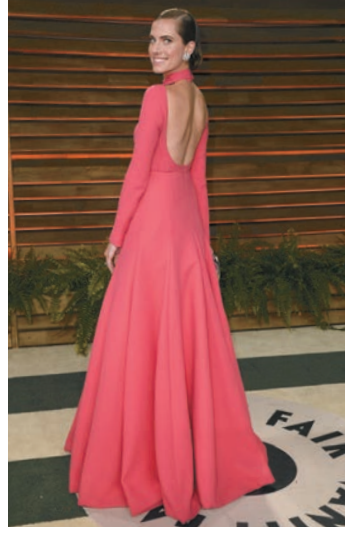
PRINCESS PINK ALLISON WILLIAMS IN EMILIA WICKSTFAD