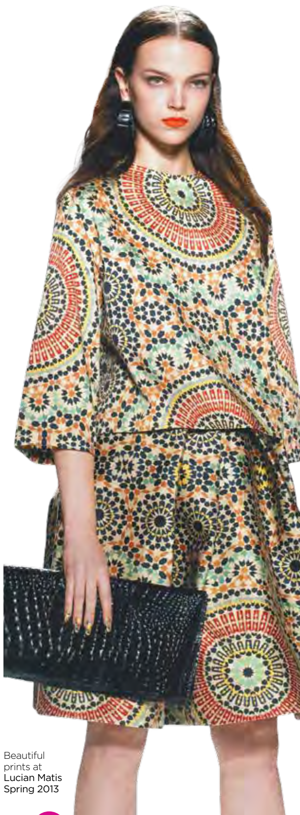
Beautiful prints at Lucian Matis Spring 2013