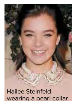
Hailee Steinfeld wearing a pearl collar

One of the sweetest pearl finds I've come across lately is a delicate pearl-encrusted Peter Pan collar that you tie around your neck with a simple little ribbon—very romantic and very chic.