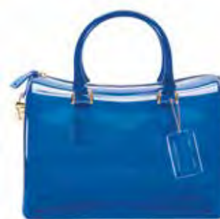
Furla Candy bag, $250, at select Hudson's Bay locations, thebay.com

Ceri Marsh is a best-selling author and co-creator of the food and family website SweetPotatoChronicles.com