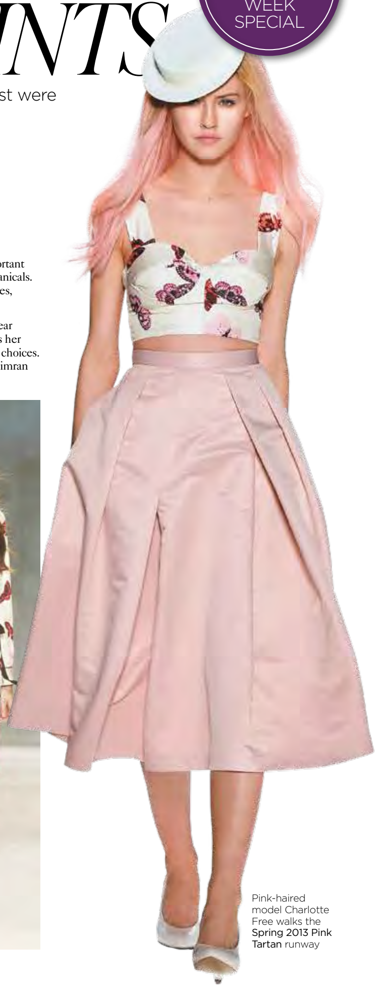
Pink-haired model Charlotte Free walks the Spring 2013 Pink Tartan runway