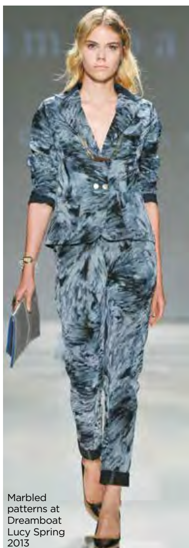
Marbled patterns at Dreamboat Lucy Spring 2013

WEAR IT WITH: "Keeping your prints within the same colour family makes mixing and matching easy. Any basic blouse or simple pullover paired with our printed trouser would create a chic but laidback look."