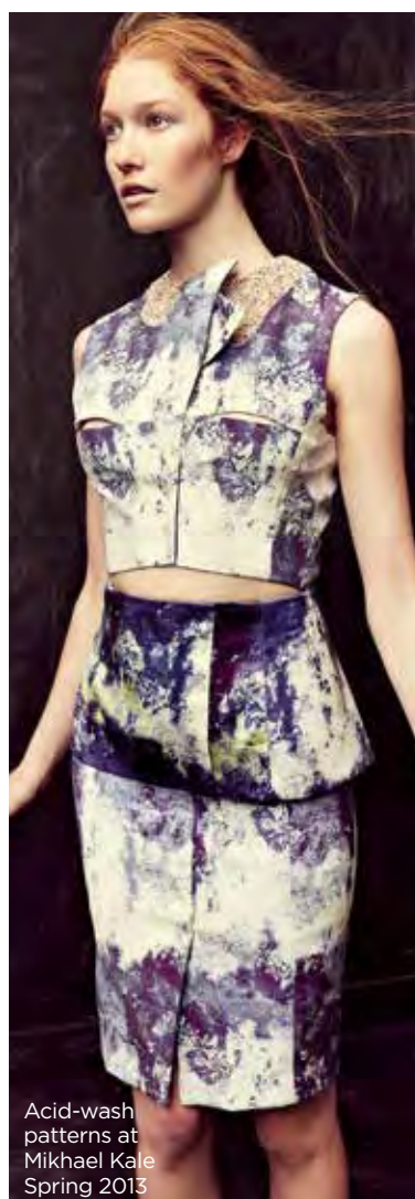
Acid-wash patterns at Mikhael Kale Spring 2013

WEAR IT WITH: "Women should wear prints the way it makes them feel beautiful. Some feel comfortable in head-to-toe patterns, while others prefer subtle prints. Try something new!"