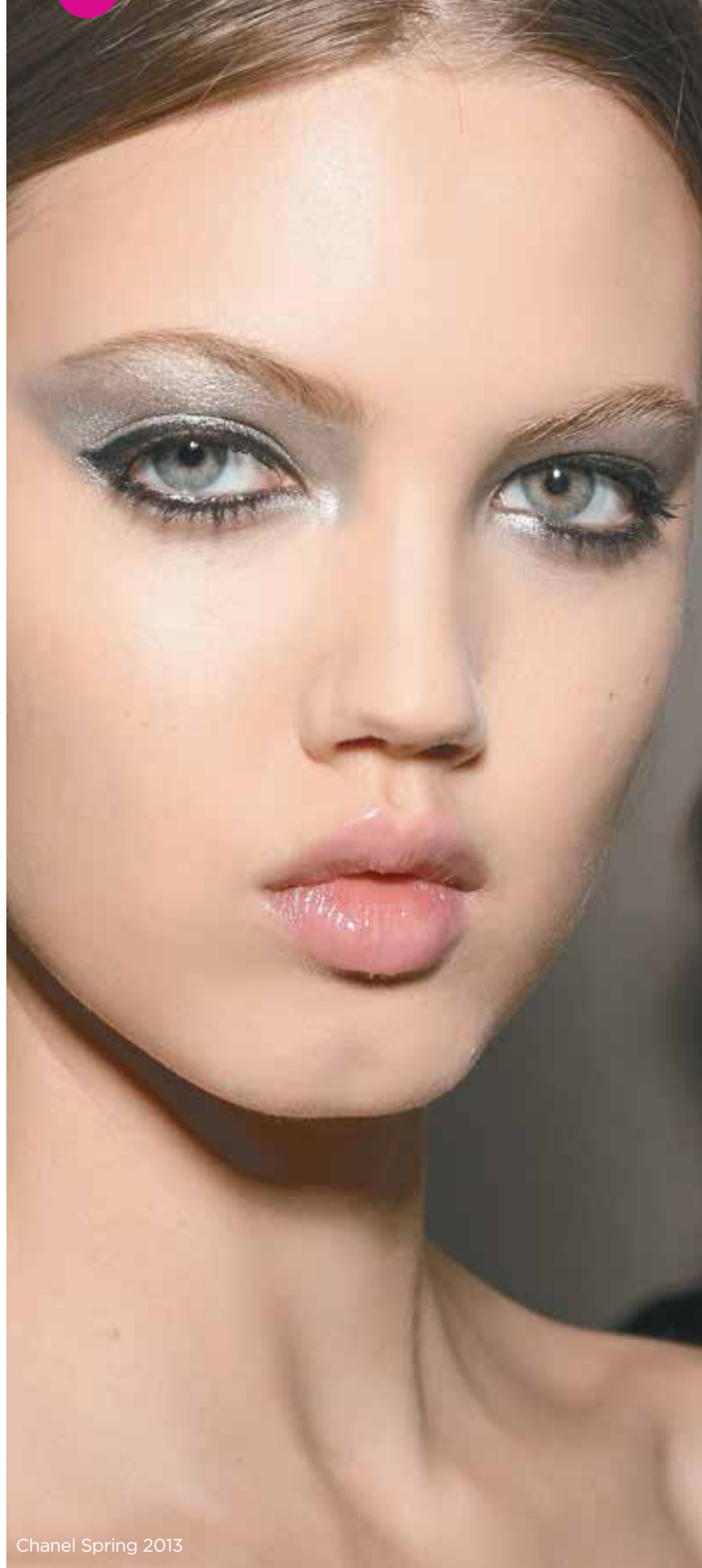
Chanel Spring 2013

web Want more dazzling eye-makeup looks? More (with tutorials!) at thekit.ca