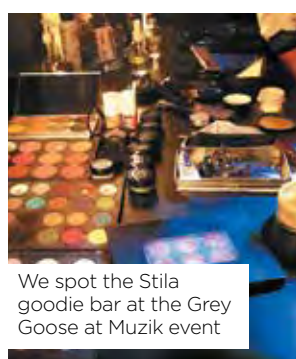
We spot the Stila goodie bar at the Grey Goose at Muzik event