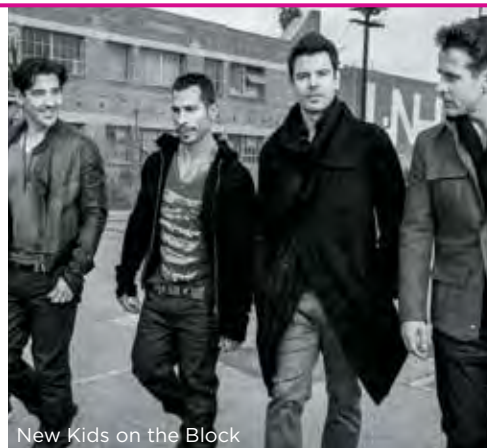
New Kids on the Block

Is your closet a cemetery of forgotten trends and bursting with things you barely—or never—wear? Enter Canadian e-shop saviour: Trendtrunk . If you love selling stuff on Ebay and Kijiji, you'll love this Canadian-based e-consignment website. You set the price and keep 80 per cent of the sale. Once your item is sold, Trendtrunk collects the funds from your happy buyer and gives them to you when the item arrives. Transfer cash to your bank account, donate the money to charity or shop another member's closet! Visit trendtrunk.com —Glynnis Mapp