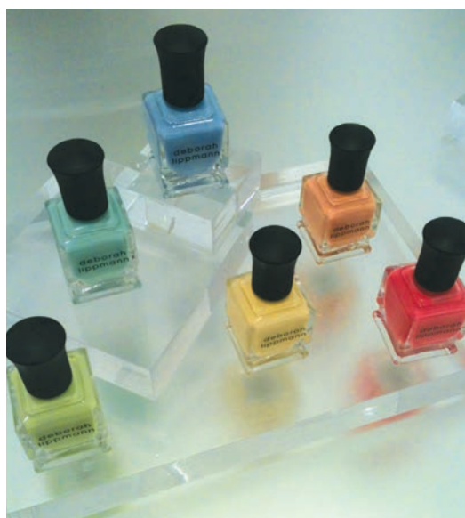
FINGER FOOD Deborah Lipmann's spring 2014 collection at Murale looks like an ice cream parlour. (Three scoops, please.)

Get your behind-the-scenes fix at instagram.com/the_kit . Candid photo-shoot outtakes, in-office antics, events, and more!