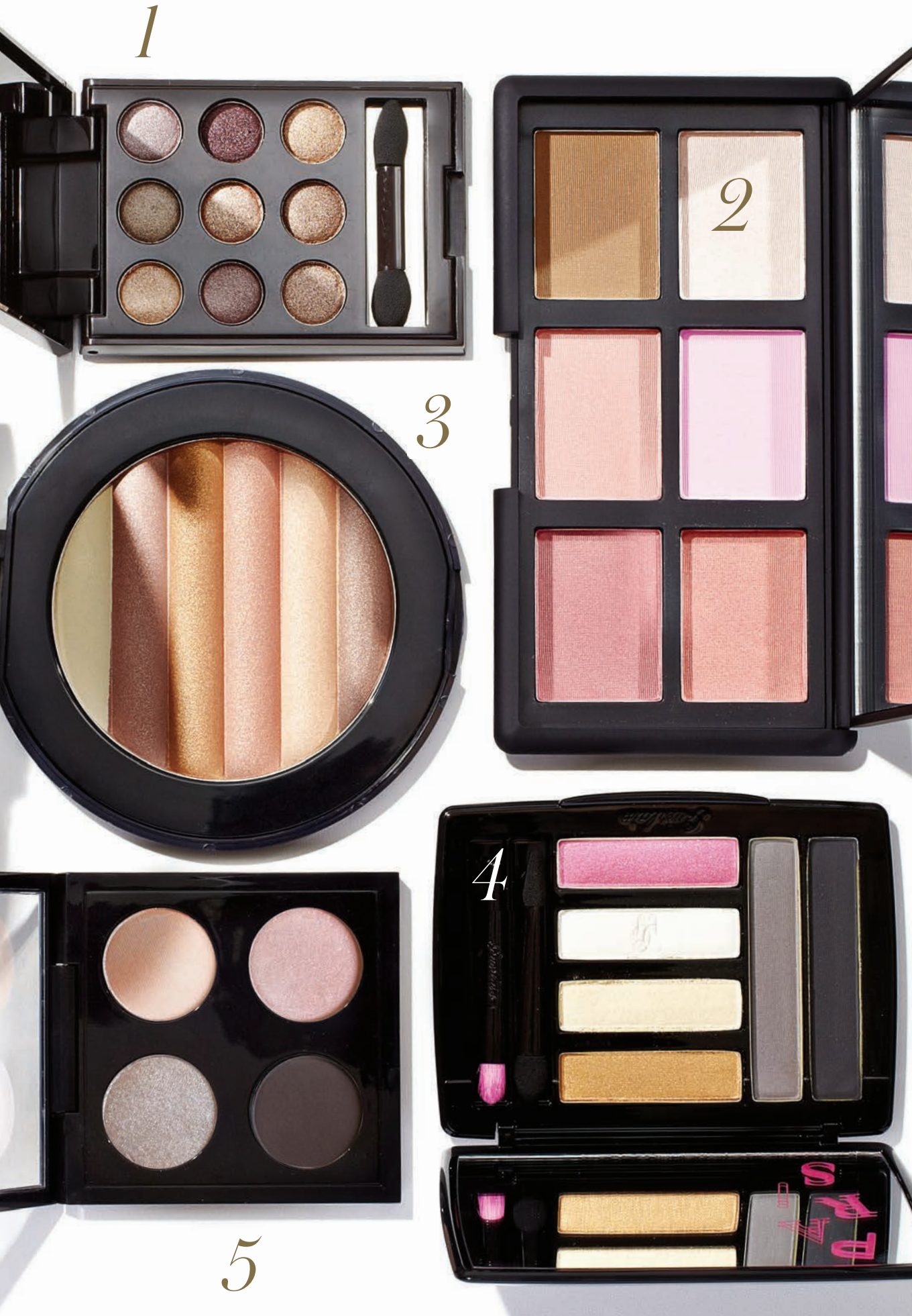
1. SPOT ON Chock full of berry and copper eyeshadows, this palette has all you need to create flattering, high-impact looks. Mark On the Dot Eye Colour Compact in Neutral, $18, avon.ca 2. BEST-SELLING BLUSH This sweet cheek palette features not only Nars's iconic Orgasm blush and Laguna bronzing powder, but four more shades. Nars Guy Bourdin Holiday Collection One Night Stand Cheek Palette, $72, sephora.ca , narscosmetics.ca 3. WHAT LATE NIGHT?

They're the perfect purse-sized gift: limited-edition compacts that offer options aplenty, from a pink-cheeked darling look for day to a smoky-eyed vixen for night