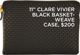
11" CLARE VIVIER BLACK BASKET-WEAVE CASE, $200