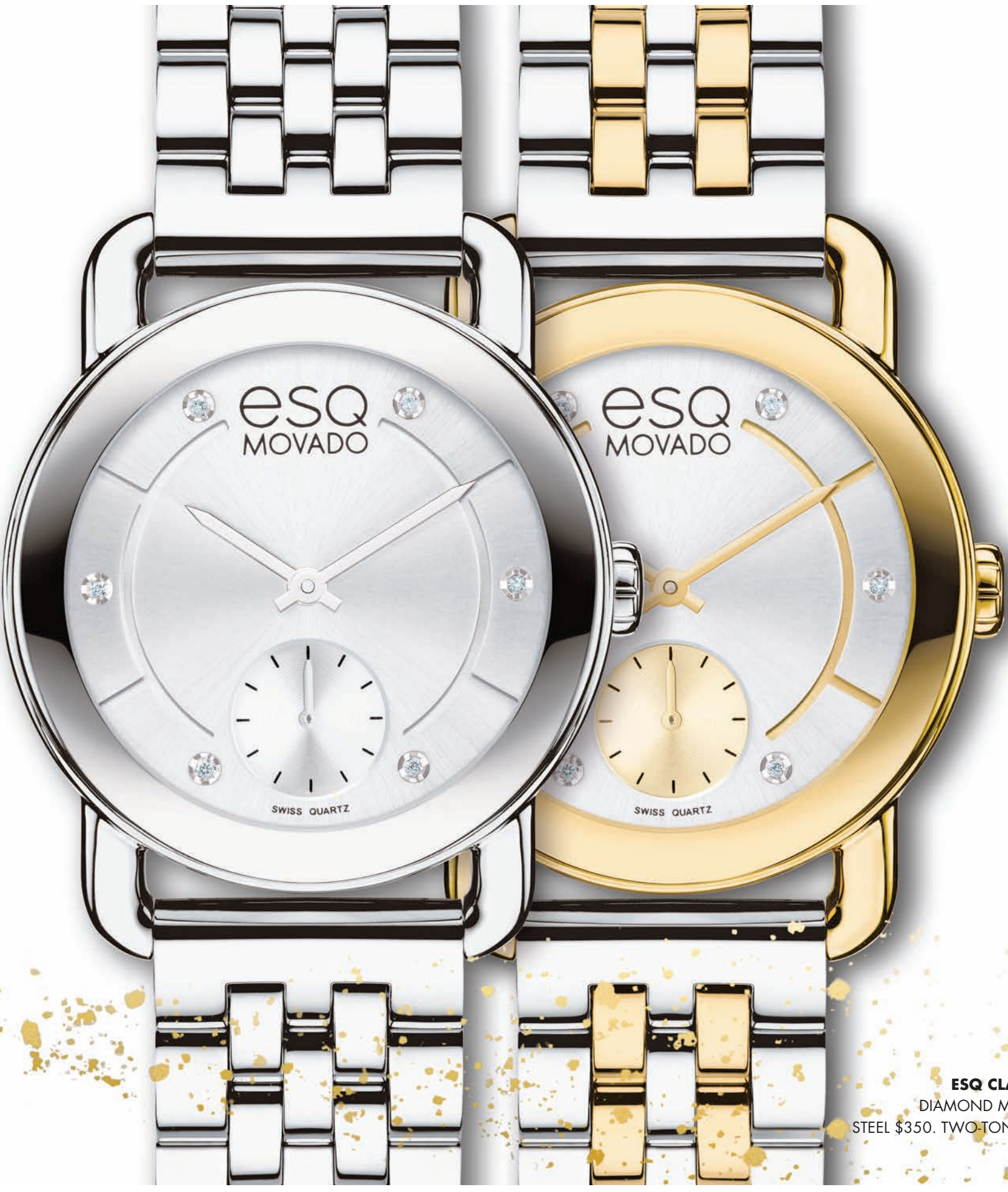
ESQ CLASSICA™ DIAMOND MARKERS. STEEL $350. TWO-TONE $395.