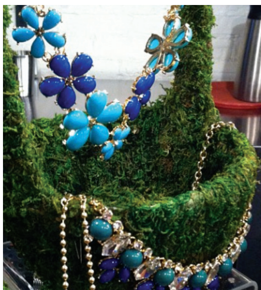
FLOWER POWER Forget the winter blues, things got bright and floral at the Sears spring 2014 media preview.