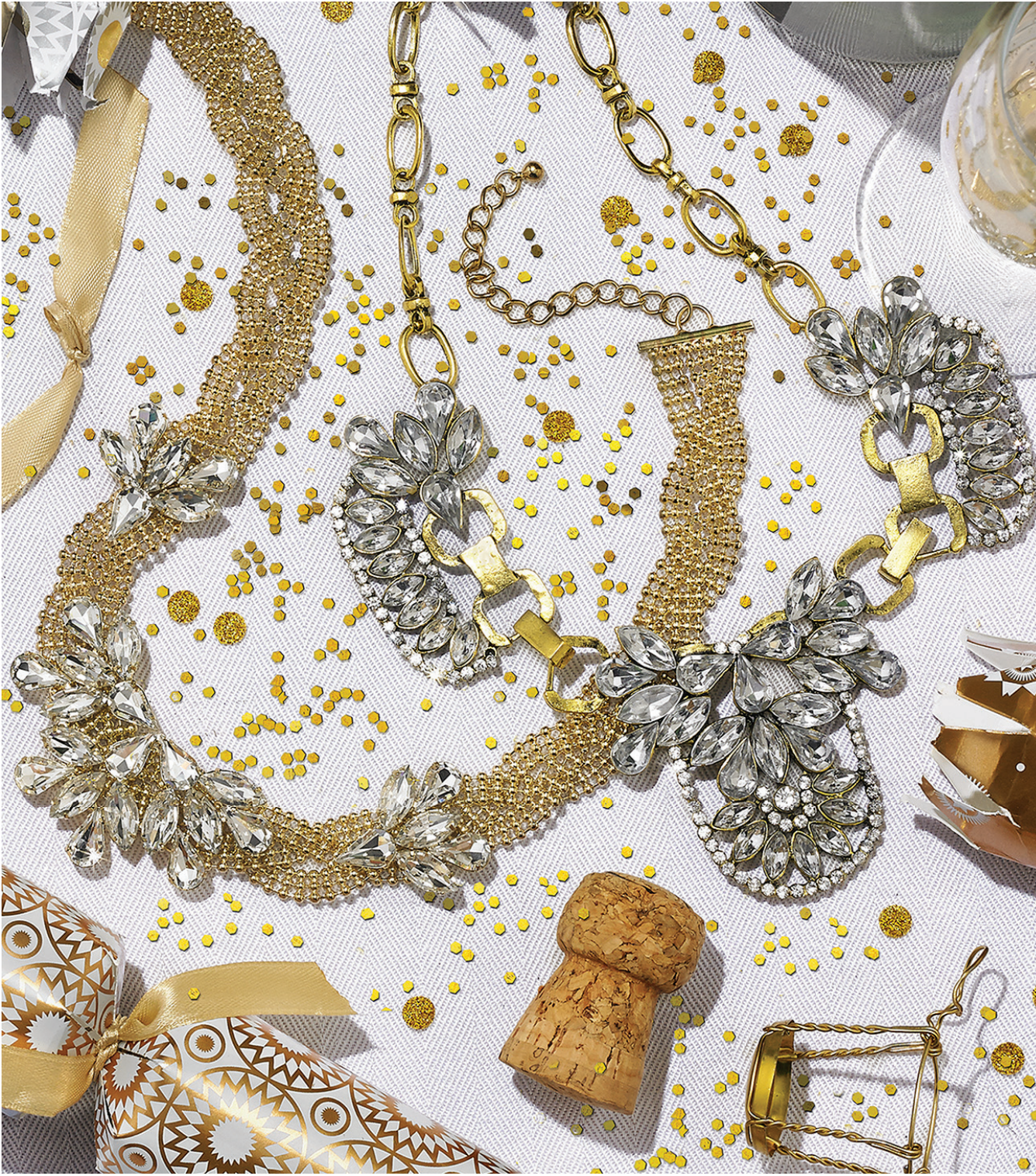
SHOP FOR JAYU BRAIDED CHAIN NECKLACE, $78; CRYSTAL AND CHAIN NECKLACE, $36, SHOPFORJAYU.COM

A megawatt necklace is all you need to amp up last year's little black dress and kick off the season with a bang by VANESSA TAYLOR