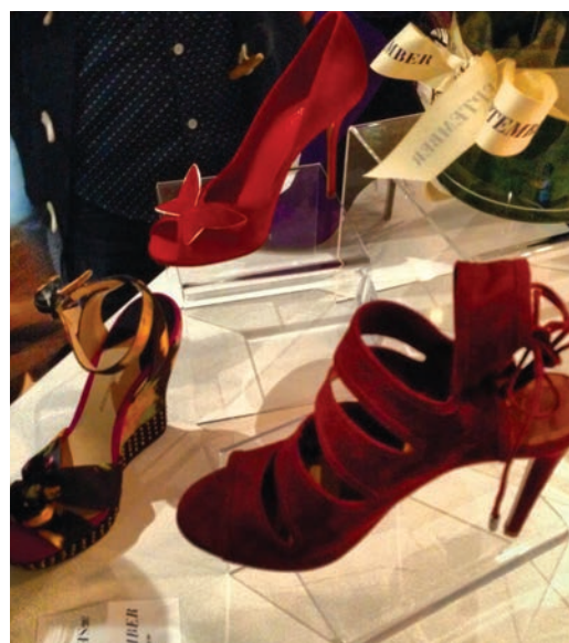
NOT JUST FOR SEPTEMBER We drooled over these ultra soft Aquazzura heels from Canadian luxury shoe e-tailer The September.