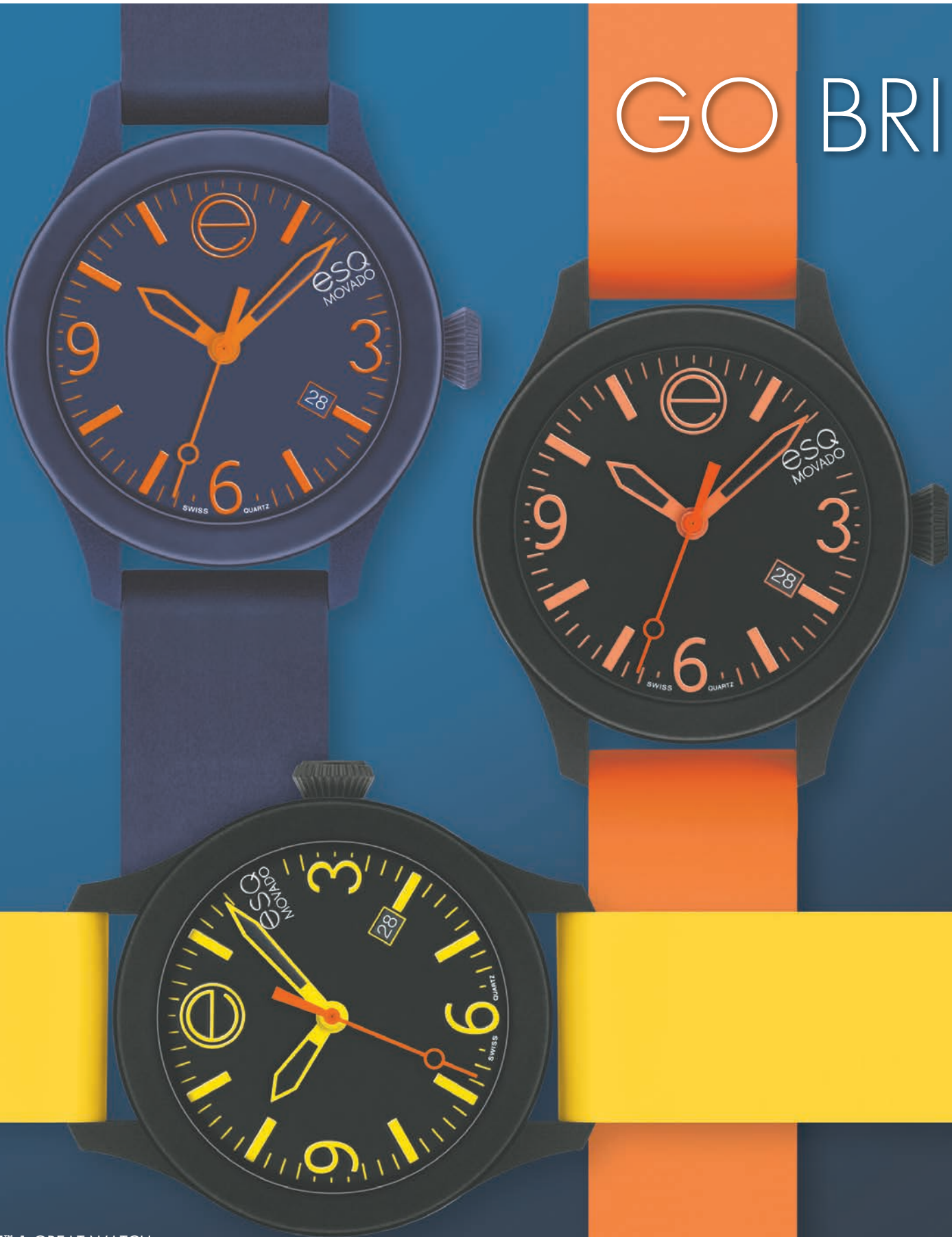
ESQ MOVADO ONE™ 1 GREAT WATCH SHOWN IN 3 COOL COLOURS, $150 EACH.