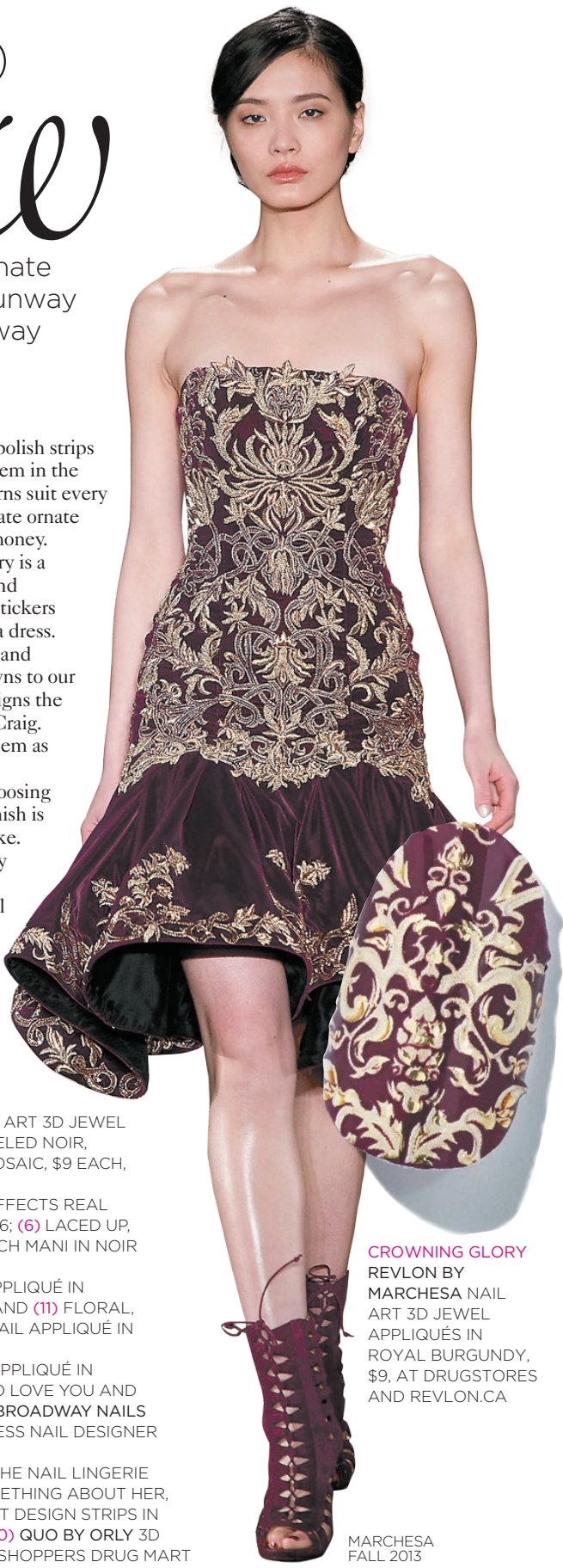
CROWNING GLORY REVLON BY MARCHESA NAIL ART 3D JEWEL APPLIQUÉS IN ROYAL BURGUNDY, $9, AT DRUGSTORES AND REVLON.CA

FIRST ROW: REVLON BY MARCHESA NAIL ART 3D JEWEL APPLIQUÉS IN (1) 24K BROCADE, (2) JEWELLED NOIR, (3) EVENING GARNET AND (4) GILDED MOSAIC, $9 EACH, AT DRUGSTORES AND REVLON.CA SECOND ROW: SALLY HANSEN SALON EFFECTS REAL NAIL POLISH STRIPS IN (5) LUST-ROUS, $16; (6) LACED UP, $10; (7) STRIPE-TEASE, $10; AND (8) FRENCH MANI IN NOIR BOUDOIR, $12, AT MASS RETAILERS THIRD ROW: OPI PURE LACQUER NAIL APPLIQUÉ IN (9) PARISIAN, (10) GEOMETRIC SPARKLE AND (11) FLORAL, $15 EACH, OPI.COM; ESSIE SLEEK STICK NAIL APPLIQUÉ IN (12) SO HAUTE!, $14, AT SALONS FOURTH ROW: ESSIE SLEEK STICK NAIL APPLIQUÉ IN (13) STICKERS AND STONES, (14) LOVE TO LOVE YOU AND (15) SNEEK-E, $14 EACH, AT SALONS; (16) BROADWAY NAILS CHERYL BURKE SIGNATURE SERIES IMPRESS NAIL DESIGNER KIT IN EGGNOG, $13, AT MASS RETAILERS FIFTH ROW: L'ORÉAL PARIS COLOUR RICHE NAIL LINGERIE IN (17) RAZZLE BE DAZZLE AND (18) SOMETHING ABOUT HER, $10, LOREALPARIS.CA; (19) AVON NAIL ART DESIGN STRIPS IN WINTER WONDERLAND, $12, AVON.CA; (20) QUO BY ORLY 3D NAIL ART STICKERS, $7, EXCLUSIVELY AT SHOPPERS DRUG MART