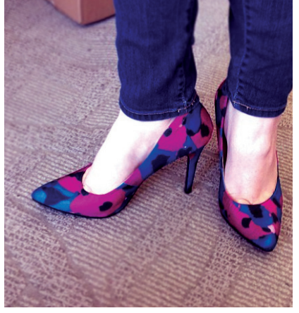
PRETTY PUMPS We love new shoes! Salina Vanderhorn models her latest Just Fab delivery.