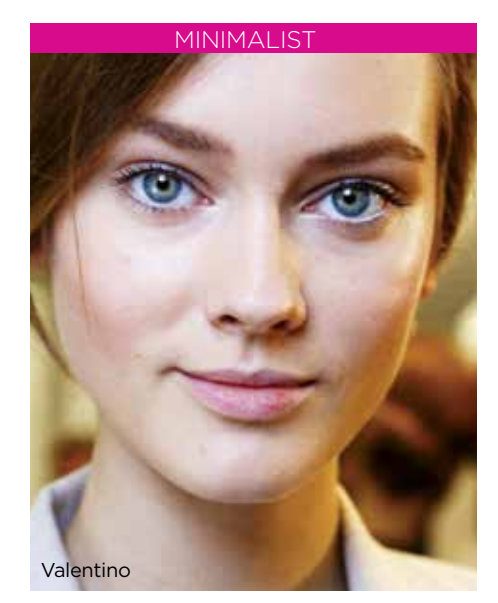
For the most elegant look going, take your beauty cue from Valentino. At that show, models' skin—and lips and cheeks—seemed to glow a most gentle rosy hue from the inside out.