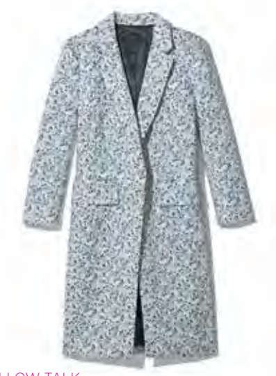
PILLOW TALK Pyjama dressing demands proportion. Pair this oversize jacket with skinny jeans. J. Crew Liberty Topper cotton jacket, $604, jcrew.com

Ever dream of just rolling out of bed and running out the door? Pay attention to the pyjama-dressing trend. Think loose button-down shirts, relaxed trousers and dinner jackets made out of silken fabrics. Pyjama dressing is subtly sexy: the antithesis of lingerie as outerwear and incredibly comfy. But, there's a fine line between stylish and sloppy. To avoid looking too literal, pair pumps and a sleek bag with this ensemble to dress it up, then rest easy. -INGRIE WILLIAMS