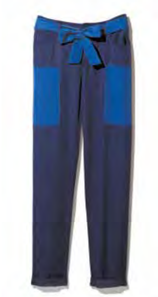
CATNAP COO Let relaxed trousers snuggle up to a trimfitting blazer, Lacoste viscose-blend pants. $165, at Lacoste boutiques