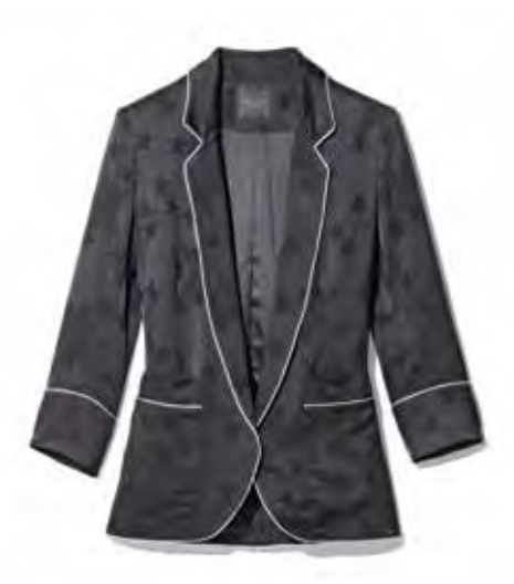
LOUNGE LADY Keep extras simple when wearing a head-to-toe lounge-y look. Smythe viscose Jacquard Pajama Blazer, $595, smythelesvestes.com