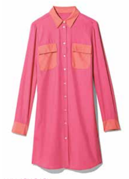
LULLABY, BABY Buttoning all the way up to the collar brings a tailored touch to nightshirt-style tunics Gap modal shirtdress, $80, gapcanada.ca