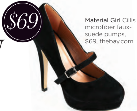
Material Girl Cillis microfiber faux-suede pumps, $69, thebay.com