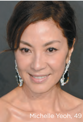
Michelle Yeoh, 49