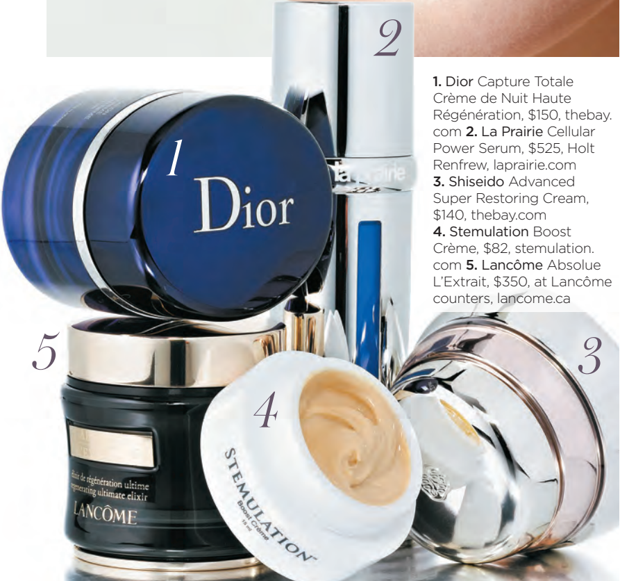
1. Dior Capture Totale Crème de Nuit Haute Régénération, $150, thebay.com 2. La Prairie Cellular Power Serum, $525, Holt Renfrew, laprairie.com 3. Shiseido Advanced Super Restoring Cream, $140, thebay.com 4. Stimulation Boost Crème, $82, stimulation.com 5. Lancôme Absolue L'Extrait, $350, at Lancôme counters, lancome.ca