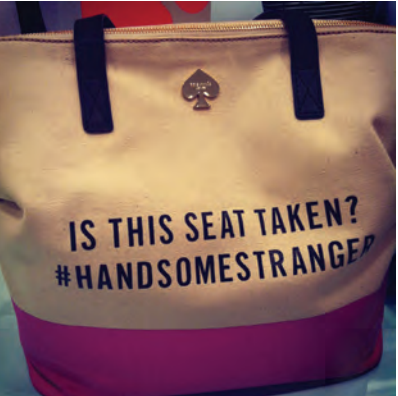
A favourite tote from Kate Spade at Yorkdale Shopping Centre in Toronto