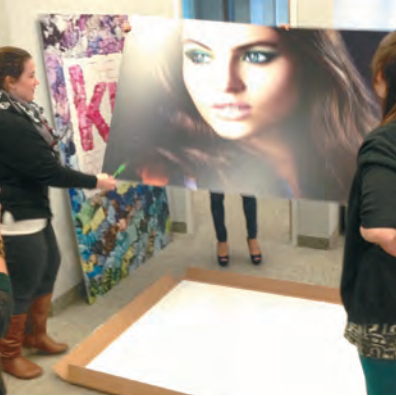
The Kit's office makeover continues with poster-sized prints of our favourite editorial images

Visit us at instagram.com/the_kit and go behind the scenes of The Kit. See our candid pictures from photo shoots, events and more.