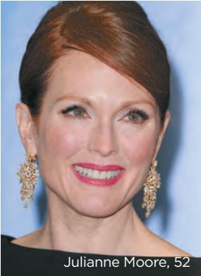
Julianne Moore, 52