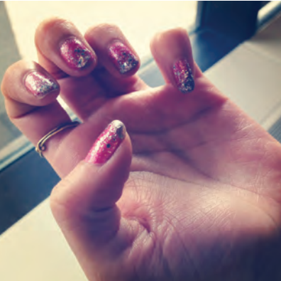
Our intern's glittery, impressive DIY nail art is inspiring and detailed