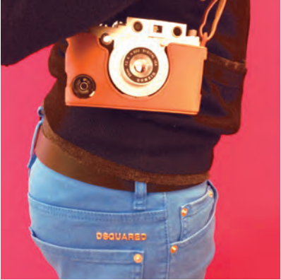
Candid photos from the office: Showing off quirky iPhone cases