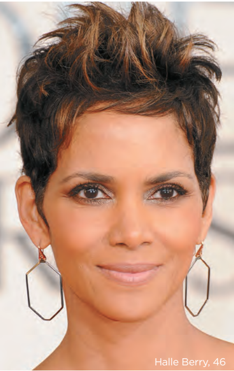
Halle Berry, 46

In show business, youth is often equated with beauty, and we've all seen the terrible lengths some celebrities will go to retain their winning looks. Dramatically-altered faces and waifish bodies are unrealistic at any age, so it's refreshing to see several celebrities take a more natural route with aging: retaining some wrinkles and character, and choosing to age gracefully—and looking so much better for it! Want proof? It's right here: • Michelle Yeoh is the poster child for beauty, brawn and brains. • Diane Lane is quietly confident and always subtly sexy. • Julianne Moore, is just radiant: her porcelain skin seems to glow from within. • Halle Berry personifies the phrase, “Aging like fine wine.” It was made just for her.