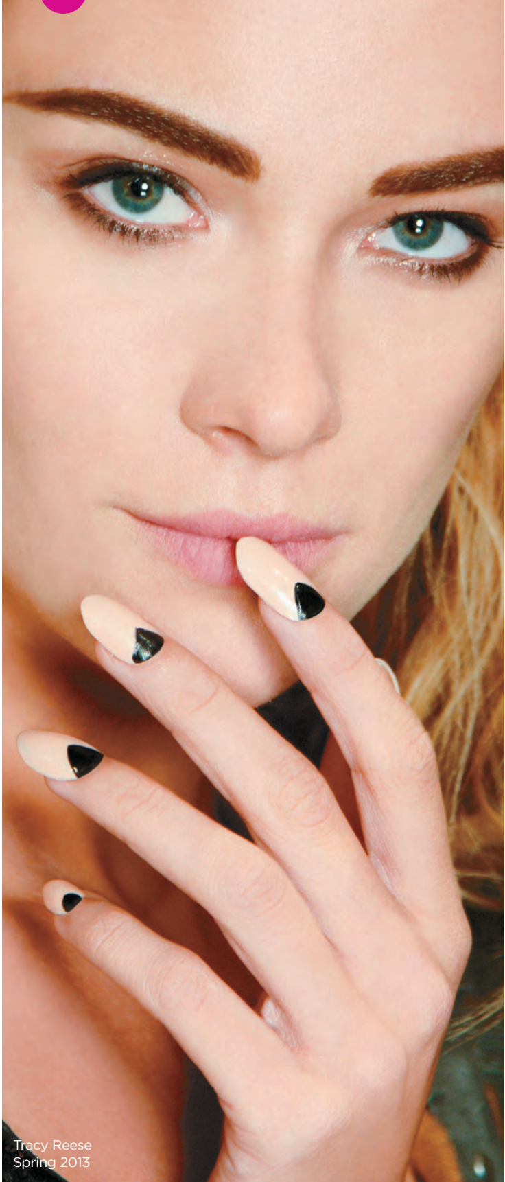
Tracy Reese Spring 2013

Learn about the latest nail trends at thekit.ca/body