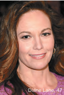
Diane Lane, 47