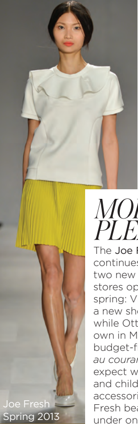
Joe Fresh Spring 2013

The Kit print feature will not publish the last week of January. For more fashion and beauty news, download the February issue of The Kit interactive magazine on Jan. 30 at thekit.ca