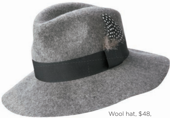
Wool hat, $48, anntaylor.com

Though an oversize hat makes a statement, a floppy brim can be cumbersome with winter winds. Enter the fedora, with a brim that flatters the face while beating the breeze