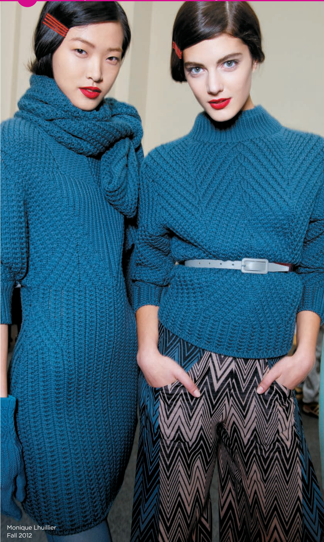
Monique Lhuillier Fall 2012

web See more stylish outfit ideas on: thekit.ca/clothing