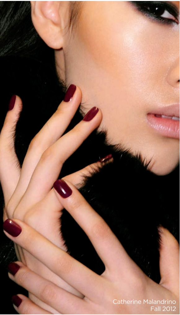
Catherine Malandrino Fall 2012