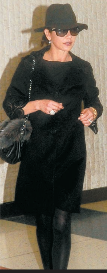
Catherine Zeta-Jones, 43

LOOK POLISHED This look can easily take you from business meetings to dinner and we love the dove-grey hat. It's much more polished than a knitted toque.