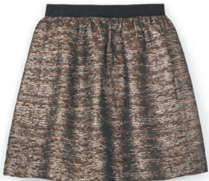
Wilfred for Aritzia Meteor Skirt $135, aritzia.com