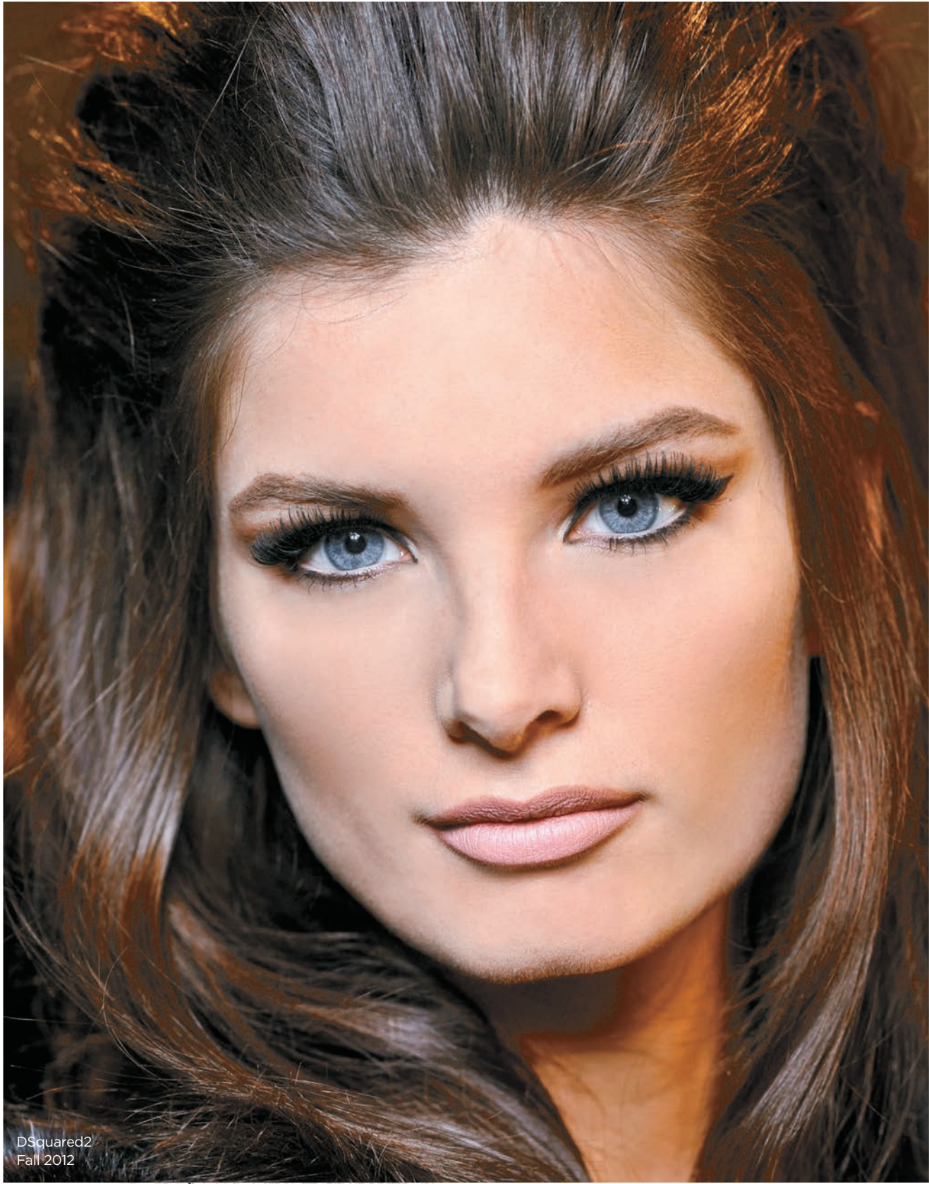
DSquared2 Fall 2012

Want full, fabulous lashes? High-tech mascaras and treatments let your eyes do all of the talking BY MICHELLE VILLETT