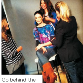
Go behind-the-scenes of our latest magazine photoshoot

Visit us at instagram.com/the_kit and go behind the scenes of The Kit. See our candid pictures from photo shoots, events and more.