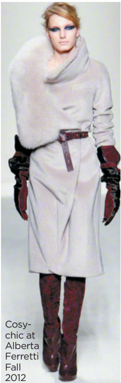
Cosy-chic at Alberta Ferretti Fall 2012