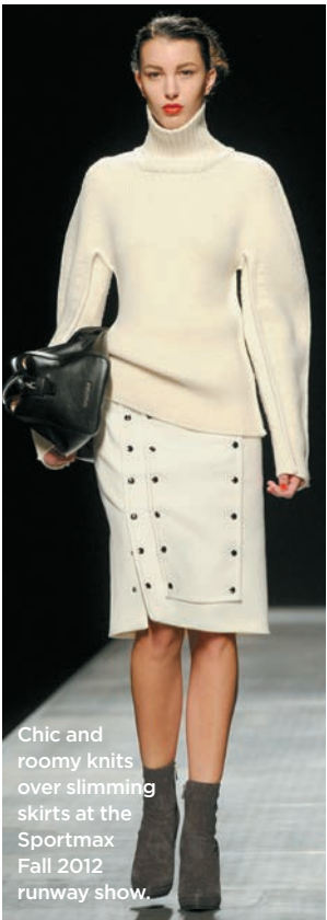
Chic and roomy knits over slimming skirts at the Sportmax Fall 2012 runway show.