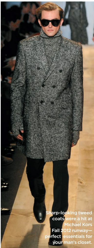
Sharp-looking tweed coats were a hit at Michael Kors Fall 2012 runway—perfect essentials for your man's closet.