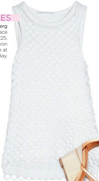
BCBG Max Azria leather wedges, $270, at BCBG Max Azria and The Bay.

Diane von Furstenberg Mackeda checkered lace and jersey tank dress, $225, net-a-porter.com. Diane von Furstenberg also available at The Room at The Bay.