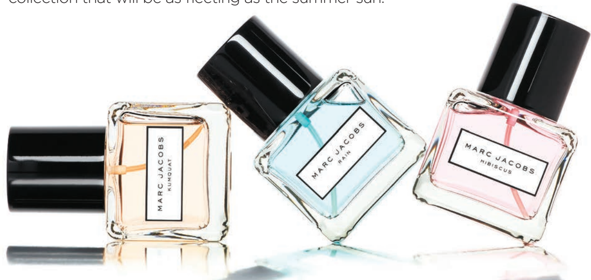
Marc Jacobs Splash the Tropical Collection: Kumquat, Rain or Hibiscus EDT (100 ml), $49 each, at The Bay, Holt Renfrew, Sephora and Murale

There's nothing like fragrance to transport you to another time and place—even if you're chained to your desk instead of skipping along the beach. Marc Jacobs's new trio of Splash toilettes is just the ticket to set you free. There's Rain, a watery floral highlighted by notes of cut grass, clementine, strawberry, amber, moss and musk. Also Kumquat, a zesty bloom-based toilette with citrus, tart kumquat and wood notes. And lastly, Hibiscus, a plush fragrance based on hibiscus but rounded out with raspberry and mandarin, freesia, tiare flower, wood and vetiver. Word to the shopping-wise: this is a limited-edition collection that will be as fleeting as the summer sun.