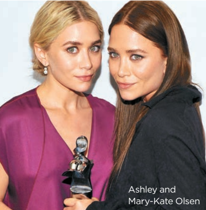
Ashley and Mary-Kate Olsen

Remember when Mary-Kate and Ashley Olsen sold their tween fashion and beauty collections at Walmart? Well, believe it or not, the stylish sisters beat out Marc Jacobs and Proenza Schouler for North America's most prestigious fashion prize: their label The Row was named Womenswear Designer of the Year by the Council of Fashion Designers of America.