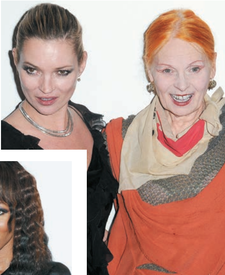
Above: Designer/model Kate Moss and designer Vivienne Westwood Left: Alexander McQueen designer Sarah Burton and model Naomi Campbell

Rumour has it that British models Kate Moss, Naomi Campbell and Rosie Huntington-Whiteley will take part in the Olympics Closing Ceremony August 12. Joined by a collection of lesser-known mannequins, the models will showcase some of the U.K.'s best designers, including Vivienne Westwood and Kate Middleton-favourite Sarah Burton of Alexander McQueen.