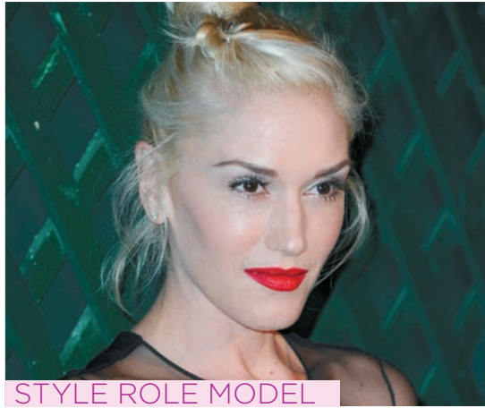
STYLE ROLE MODEL

KIT GIRL: MARC MURI; THEKIT.CA: GETTY IMAGES; PRODUCTS: GEOFFREY ROSS; OFF-FIGURE STYLING: BREANNA GOW/JUDY INC.; CELEBRITY: GETTY IMAGES