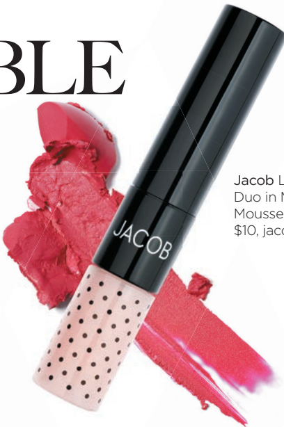
Jacob Lip Duo in Miss Mousseline, $10, jacob.ca

Some of the most valuable real estate is the space inside your on-the-fly cosmetics case. Must be why we're seeing more and more dual-ended items that maximize your primp choices as they lighten the load.