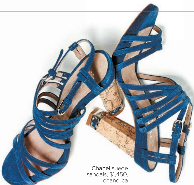
Chanel suede sandals, $1,450, chanel.ca