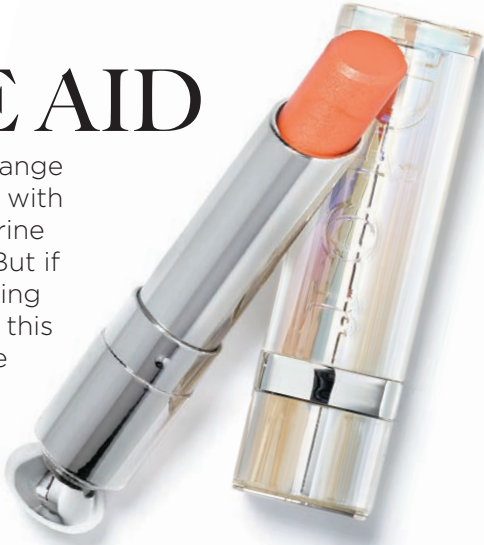
$31, at Murale, Sephora, The Bay and Holt Renfrew

The growing popularity of orange lips has certainly accelerated with Pantone’s selection of Tangerine Tango as 2012’s official hue. But if you’re still a bit shy about going so bright, a lighter shade like this Dior Addict Lipstick in Palace will do the tangy-sweet trick.