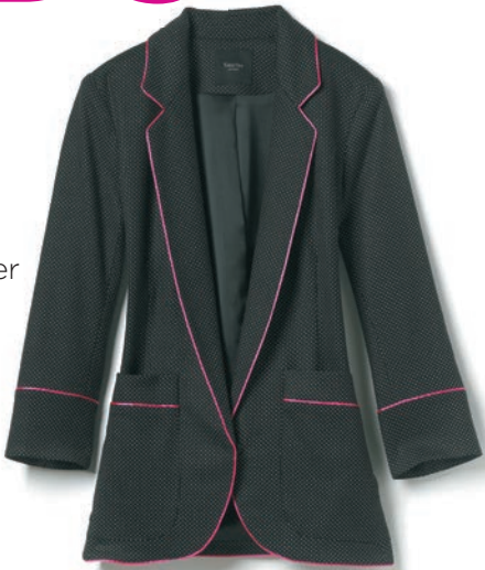
Smythe Pajama viscose-blend blazer, $450, Holt Renfrew, smythelesvestes.com