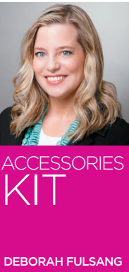
ACCESSORIES KIT DEBORAH FULSANG