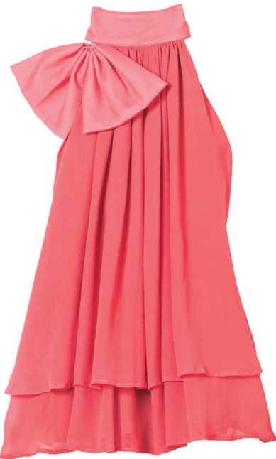
Brose silk top, $288, marikabrose.com