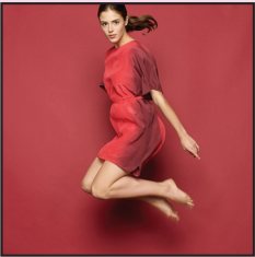
French Connection Style Stage