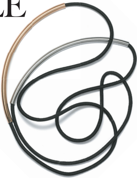
Goody Double Wear Head Wraps, $5 for a 2-pack, goody.com

Ideal for the girl on the go, Goody Double Wear Head Wraps are elastic headbands that double as necklaces. We love them stacked together around your neck as an accessory at the office—and then one or two to hold your hair back when you work out. You know what that means: you can go straight from the office to the yoga studio—no excuses.