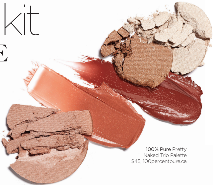
100% Pure Pretty Naked Trio Palette $45, 100percentpure.ca

This eco-responsible 100% Pure Pretty Naked Trio Palette of synthetics-free mineral eyeshadow, blush and fruit-pigment lip colour is ideal for a fresh-faced finish that puts the focus on you, not your makeup. Loaded with antioxidants and vitamins.